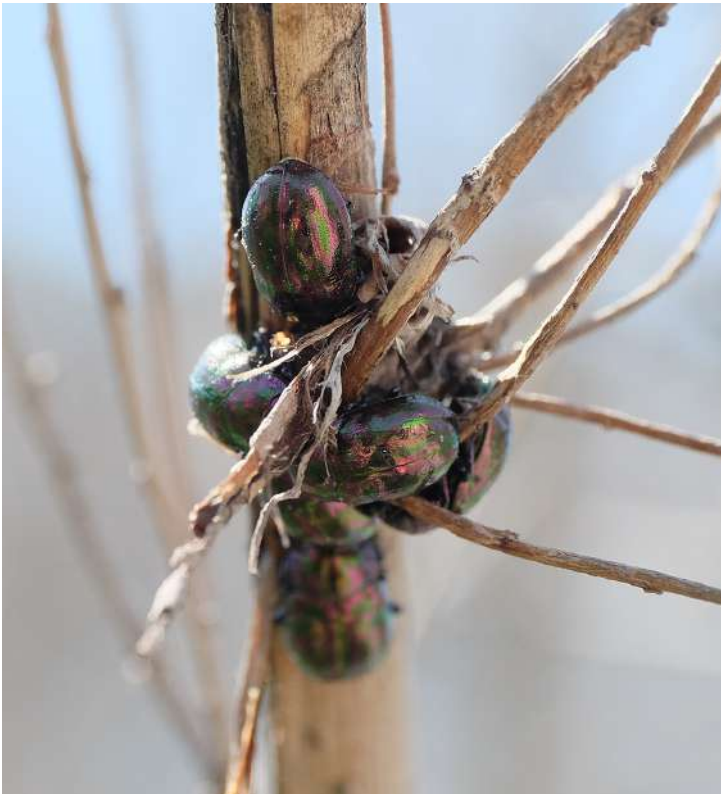
Figure 6. Ambrostoma superbum on Ulmus pumila .