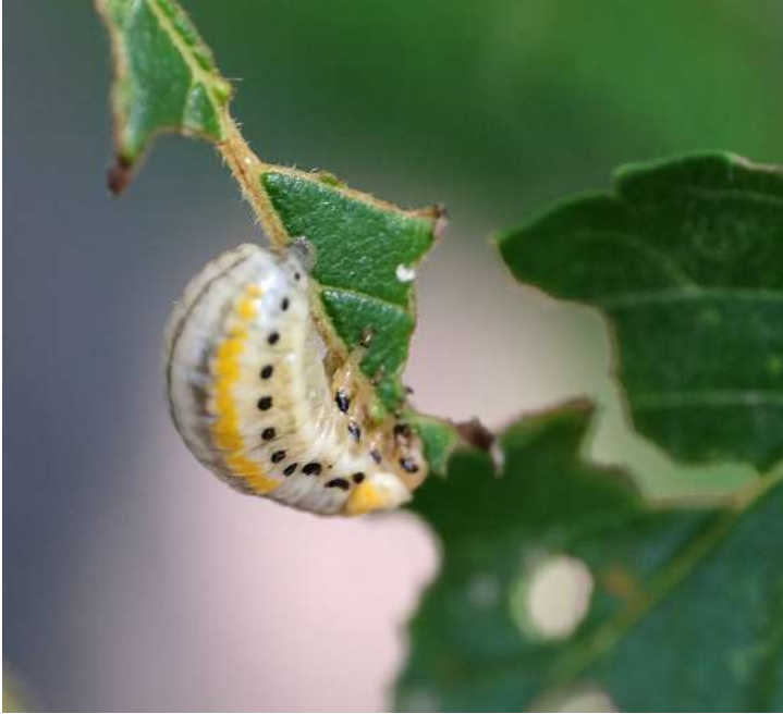
Figure 5. Larva of Ambrostoma superbum on a leaf of Ulmus pumila .