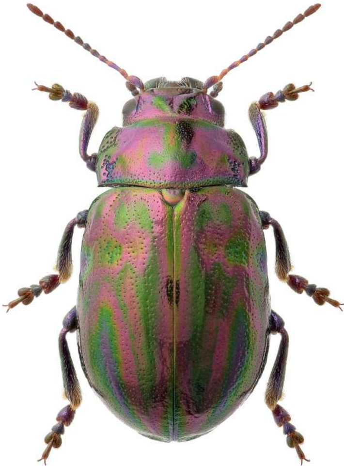
Figure 2. Ambrostoma superbum from Novosibirsk, male, dorsal view.

Distribution. Southeast of Western Siberia (Fig. 1), South of Eastern Siberia and the Russian Far East, Mongolia, China (including Taiwan), and Korea.