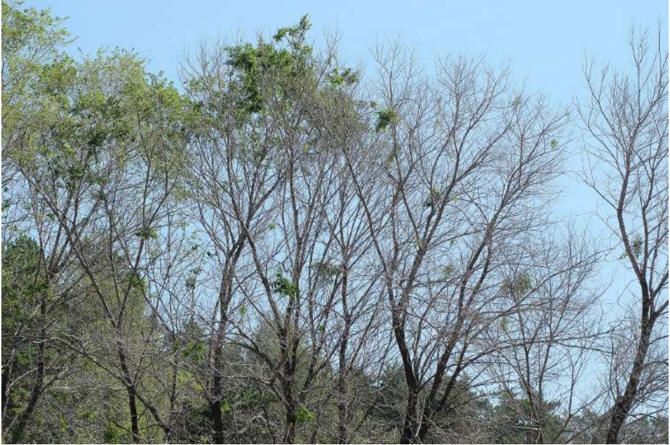
Figure 3. Trees ( Ulmus pumila ) damaged by Ambrostoma superbum from Lesosechnaya str.