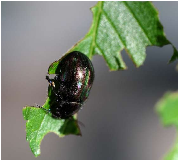
Figure 4. Ambrostoma superbum on a leaf of Ulmus pumila .