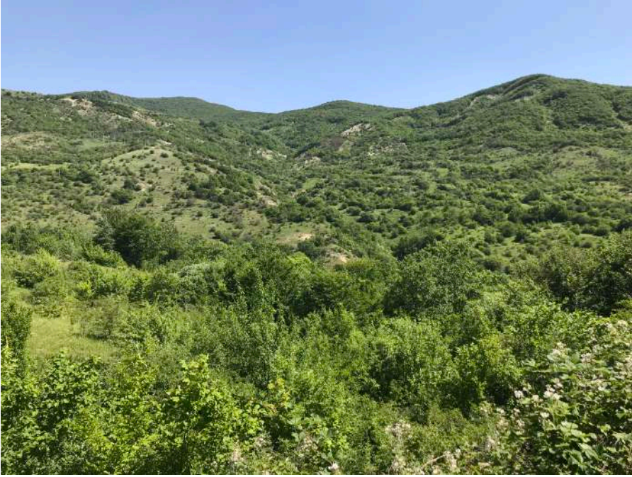
Figure 5. Tskhinval Distr., 2 km NW Grom, 42^{\circ}10'6''\text{N} / 44^{\circ}11'53''\text{E}.