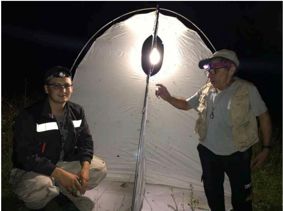
Figure 2. Light screens Naturaliste-180.

The collections were carried out by manual collection during the daytime and at dusk, as well as on light screens Naturaliste-150 and Naturaliste-180 (using lamps OSRAM-160, 250 W), powered by the inverter generator Honda EU10i (Fig. 2) and autonomous light traps ENTOSPHINX lamp UV LED 12 V/19,2W (equipped with diodes 240 UV LED) (Fig. 3). Deadening of the specimens was carried out using ethyl acetate. The material was mounted on entomological pins.