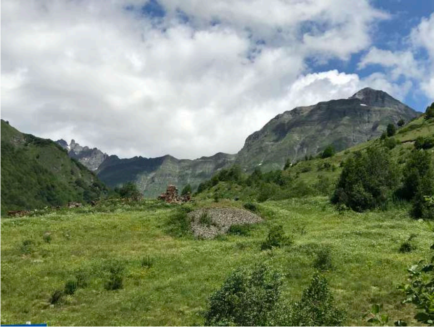
Figure 9. Dzaus Distr., Dvalet Range, near Kherusel't, 42^{\circ}32'37''\text{N} / 43^{\circ}47'32''\text{E}.