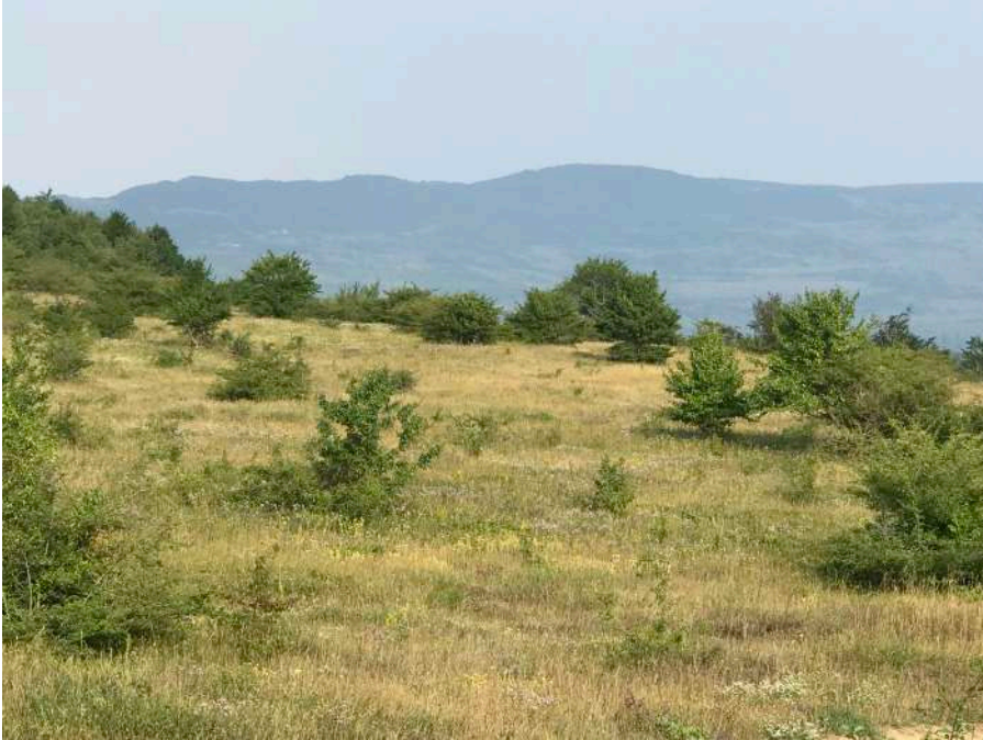
Figure 11. Znaur Distr., 2 km W Dzagina, 42°14'34"N / 43°43'11"E.