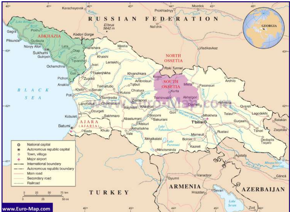
Figure 1. South Ossetia on the map of Caucasus.

most 90 % of the territory of the republic is located at the altitudes higher than 1000 m above sea level. The highest point of South Ossetia is mountain Khalatsa (3938 m). The mountainous portion of the republic is presented by the Dvaletskiy ridge on the border with Russia and the transverse ridges – Rachinsky, Likhsky, Kesheltsky, Mashkharsky, Dzausky, Gudissky, Kharulsky, Lomissky and Mtiuleti. The foothill area is located in the extreme south of the region, where the valleys of the rivers Prone, Greater and Lesser Liakhva, Mejuda and Ksan go to the northern outskirts of the Inner Kartli Plain.