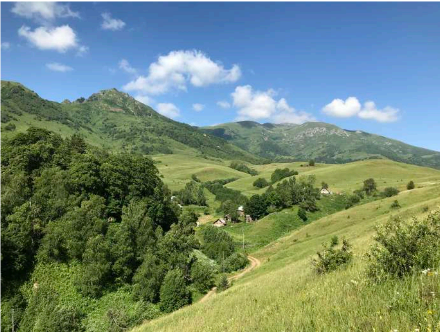
Figure 8. Dzaus Distr., Rachinsky Range, near Dодtota, 42^{\circ}27'25''\text{N} / 43^{\circ}43'18''\text{E}.