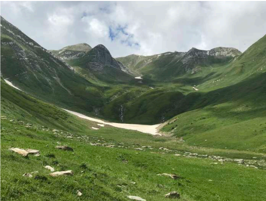
Figure 10. Dzaus Distr., Mtiulet Range, near Erman, 42^{\circ}31'2''\text{N} / 44^{\circ}14'10''\text{E}.