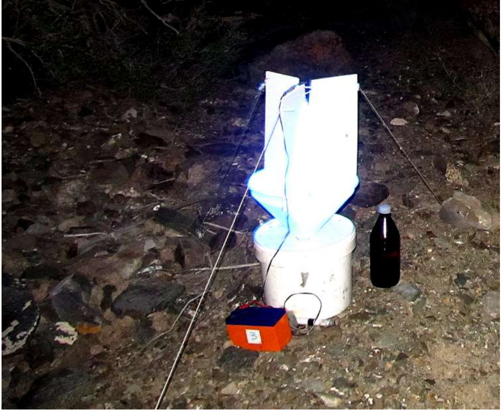
Figure 3. Autonomous light traps.