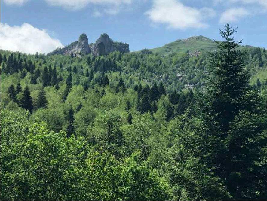
Figure 7. Dzaus Distr., 4 km NNE Kvaisa, Koz lake, 42^{\circ}33'32''\text{N} / 43^{\circ}37'59''\text{E} (photo by R. Yakovlev).