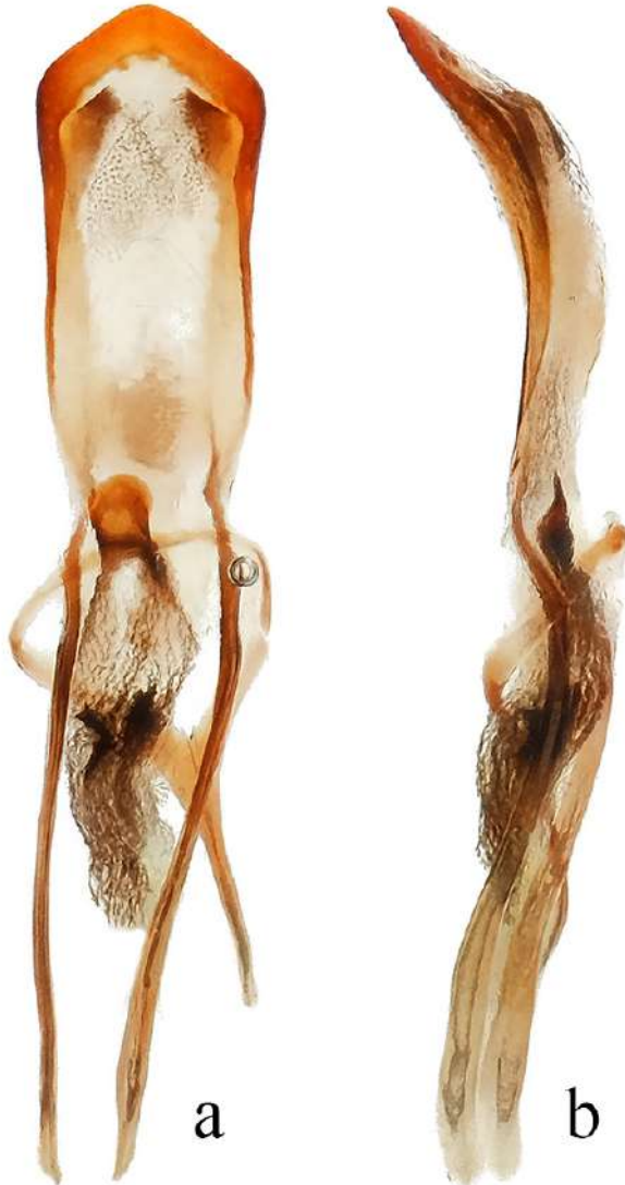
Figure 2. Ceutorhynchus rusticus from Altai Krai, aedeagus: a –dorsally; b – laterally.

Distribution. Europe, Caucasus, Western Siberia (Fig. 5).