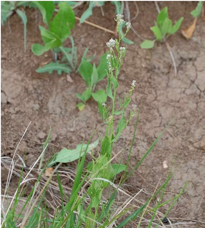
Figure 4. Collection plant of Ceutorhynchus rusticus .