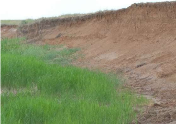
Figure 3. Habitat of Ceutorhynchus rusticus .