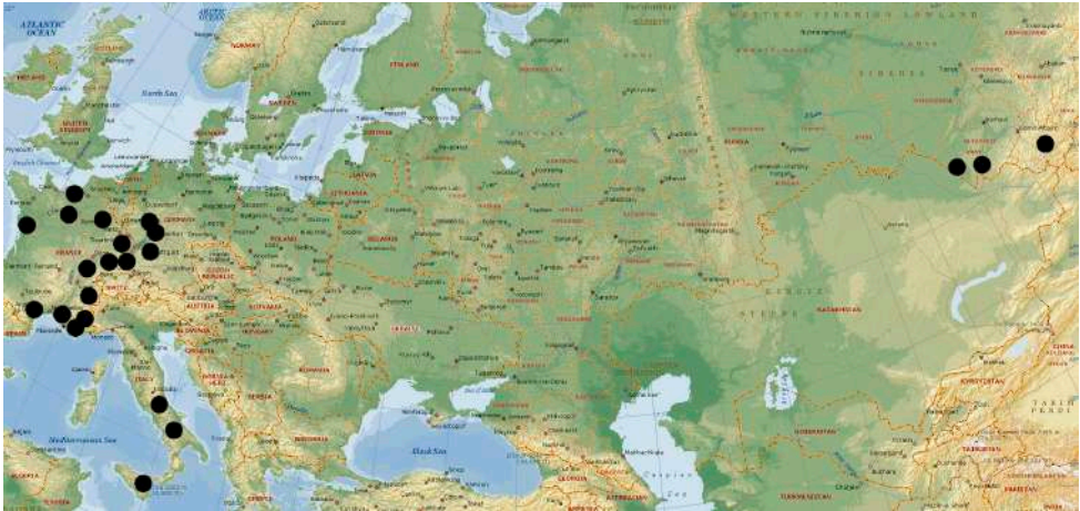
Figure 5. Distribution of Ceutorhynchus rusticus .