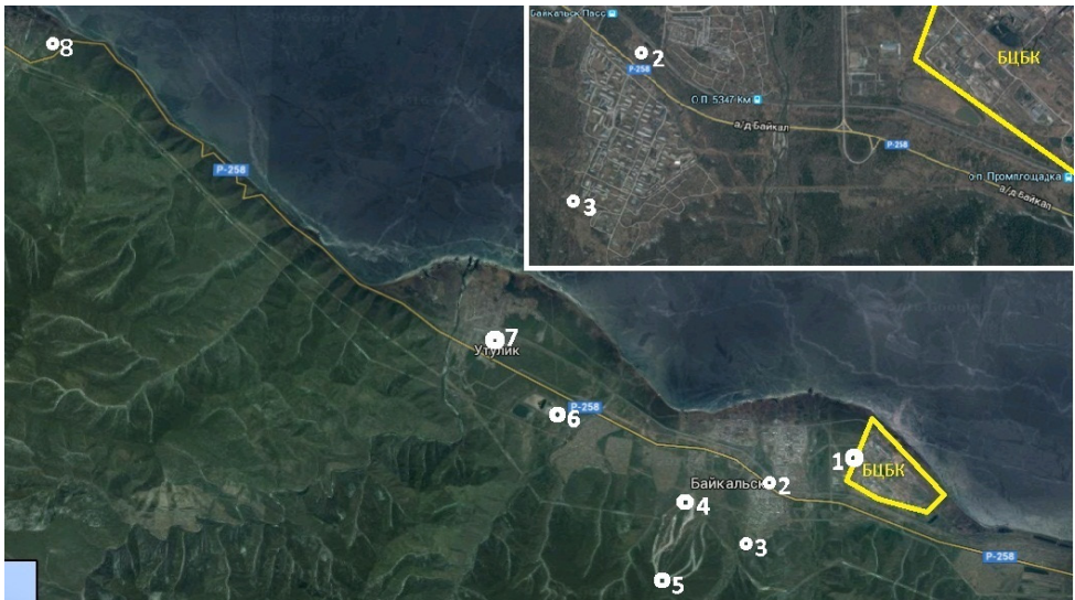
Figure 2. Sampling sites of the cedar needles: 1 – BPPM industrial zone; 2 – Baykalsk, the area between the railway and the park; 3 – Baykalsk, Yuzhny district, residential area; 4 – Mount Sobolinaya (foot); 5 – Mount Sobolinaya (peak); 6 – Overgrown with vegetation waste collection BPPM; 7 – Utulikskaya dacha; 8 – Areas for the reproduction of seeds of forest species.

The non-destructive method of X-ray fluorescence analysis for plants has been developed at the Institute of Geochemistry of the Siberian Branch of the Russian Academy of Sciences (Irkutsk, Russia) (Chuparina and Martynov 2011). It does not require the processing of samples by chemical substances and temperature. Finely ground plant sample material (less than 100 microns) is pressed into a tablet emitter on a boric acid substrate. The needles sample mass is 1 g. The sulfur content in the needles is determined by X-ray fluorescence analysis on an S4 Pioneer wave spectrophotometer (Bruker AXS, Germany). The error characterizing the convergence of the results of X-ray fluorescence analysis does not exceed 5% rel.