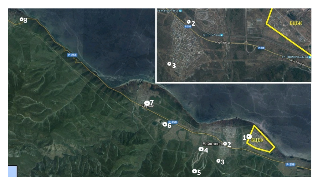
Figure 2. Sampling sites of the cedar needles: 1 – BPPM industrial zone; 2 – Baykalsk, the area between the railway and the park; 3 – Baykalsk, Yuzhny district, residential area; 4 – Mount Sobolinaya (foot); 5 – Mount Sobolinaya (peak); 6 – Overgrown with vegetation waste collection BPPM; 7 – Utulikskaya dacha; 8 – Areas for the reproduction of seeds of forest species.

The non-destructive method of X-ray fluorescence analysis for plants has been developed at the Institute of Geochemistry of the Siberian Branch of the Russian Academy of Sciences (Irkutsk, Russia) (Chuparina and Martynov 2011). It does not require the processing of samples by chemical substances and temperature. Finely ground plant sample material (less than 100 microns) is pressed into a tablet emitter on a boric acid substrate. The needles sample mass is 1 g. The sulfur content in the needles is determined by X-ray fluorescence analysis on an S4 Pioneer wave spectrophotometer (Bruker AXS, Germany). The error characterizing the convergence of the results of X-ray fluorescence analysis does not exceed 5% rel.