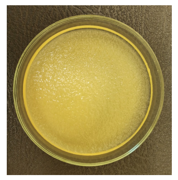
Figure 1. Cultural features of the isolated oomycete under a layer of sterile water.

Microscopic examination revealed branched non-septic mycelium, thin hyphae, young and proliferating clavate zoosporangia with spherical zoospores (Figures 2, 3). Oogonia and antheridia were not observed.