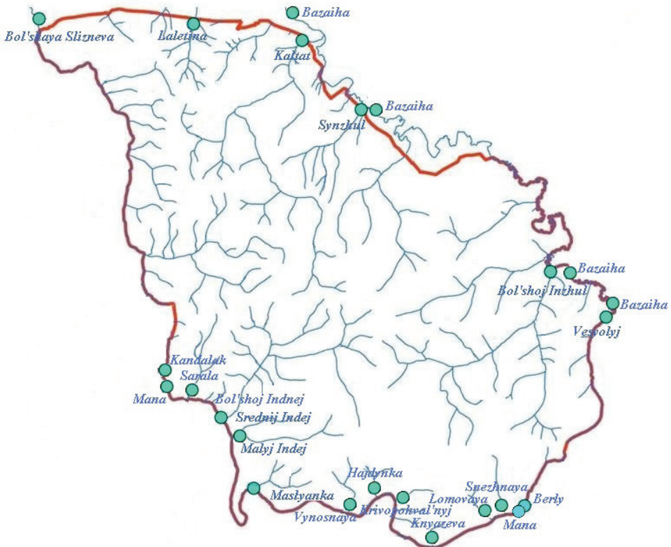
Figure 1. Map-scheme of the location of observation sites in the territory of the Krasnoyarsk Stolby National Park.

The Shannon index values were calculated taking into consideration both the parameters of number and biomass (Shitikov et al. 2005), since this version of the calculations "harmoniously combines both factors of abundance" (Rozenberg 2010).