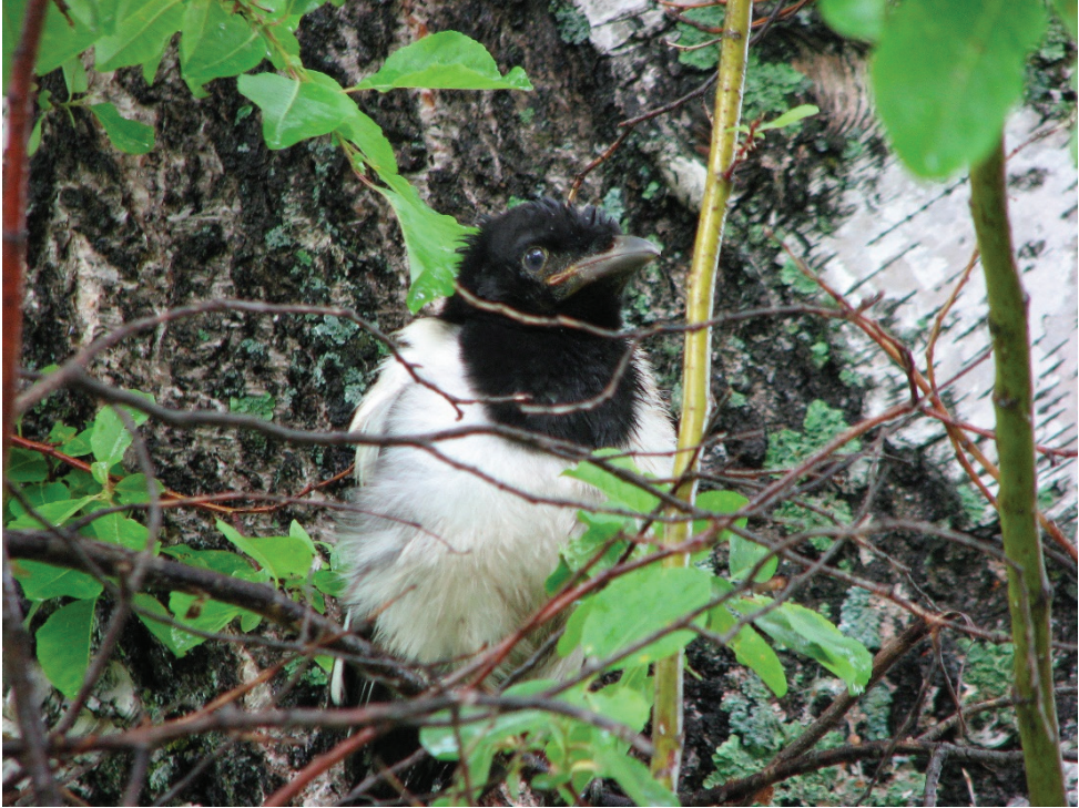
Figure 3. Fledged chick of Pica pica .

ind/km 2 . In 2021 a pair of Ravens was observed at the rookery site from 15 to 16 July, and one individual was also seen on 18 July. The density was 0.17 ind/km 2 . The average density for all years was 0.14 ind/km 2 . We registered 3-4 individuals.