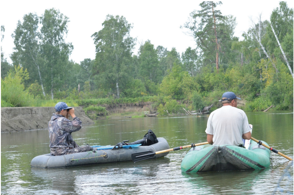
Figure 2. Expedition group on the route. 15 July 2021.