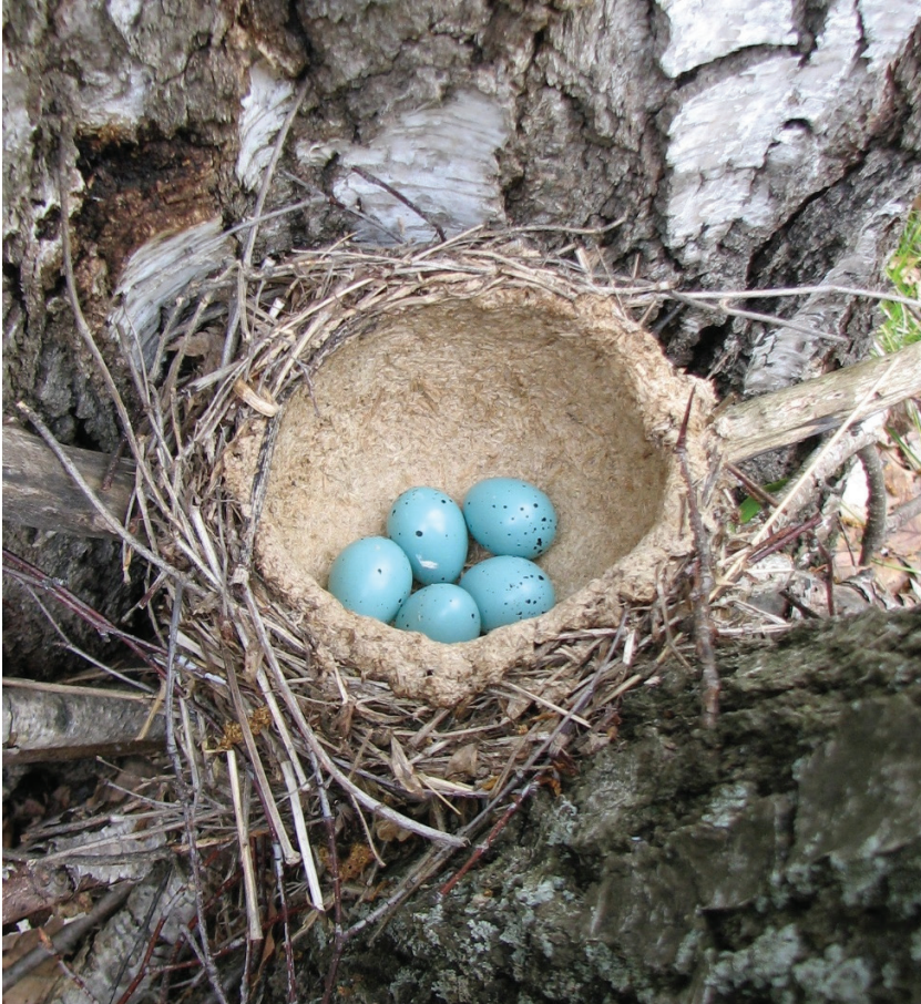
Figure 4. The nest of Turdus philomelos .

24. Long-Tailed Tit ( Aegithalos caudatus Linnaeus, 1758). Rare species. We recorded one bird on 18 July and 20-20 July during overnight and in the morning on the left bank in the direction of Listvyanka village. During the night and morning on the left bank of the river towards Listvyanka. Density was 1.47 ind/km 2 . The average density in all years was 0.73 ind/km 2 . We registered 26-44 individuals.