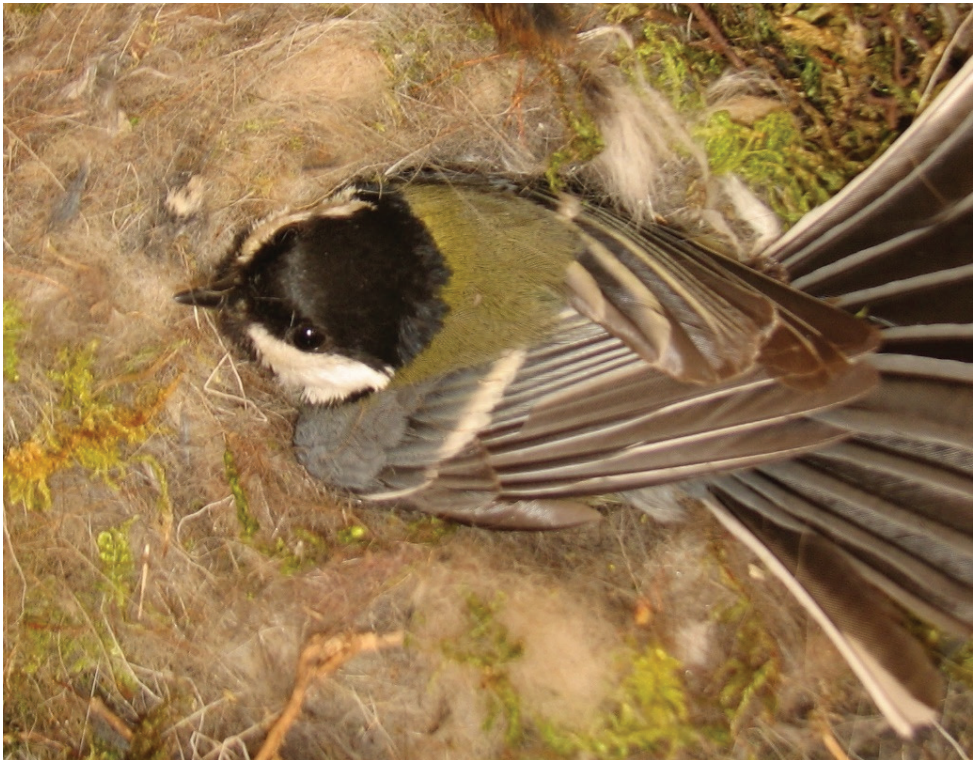
Figure 5. Parus major on the nest.

27. Great Tit ( Parus major Linnaeus, 1758). One of the most common species. In 2012 we found a nest of tits (Fig. 5). In 2017, several individuals were observed on 29 May at an overnight site. The density was 0.62 ind/km 2 . In 2021, daily from 16-20 July, tits were widely represented along the route by single individuals and flocks of 10-20 birds. The density was 4.17 ind/km 2 . The mean density in all years was 1.51 ind/km 2 . We registered 15-90 birds.