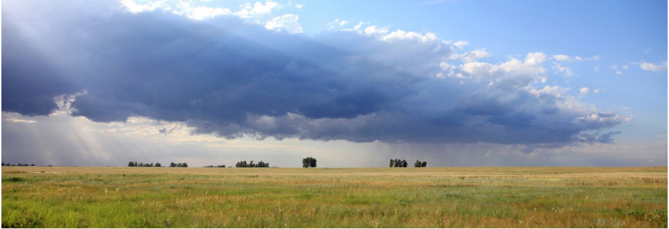
Figure 1. Steppe on the South of Omsk Region, Russko-Polyansky district, 2 km SE of Buzan vill., 22.VI.2018, photo by S.A. Knyazev.

Verkhneilyinka – Cherlacksky district, 2 km NW of Verkhneilyinka vill., 54°33'30.61"N, 74°14'26.02"E.