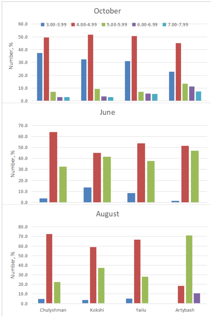
Figure 3. The ratio of size groups in the Pantocsekiella teletskoyensis population of Lake Teletskoye in 2021-2022.