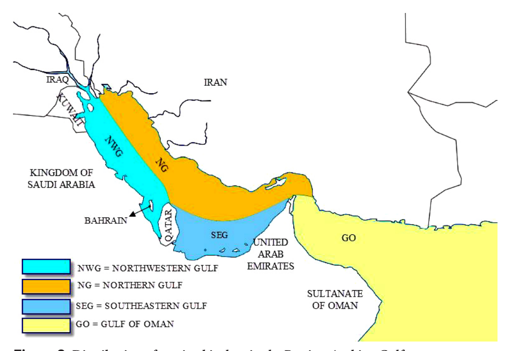
Figure 3. Distribution of marine bivalves in the Persian-Arabian Gulf.