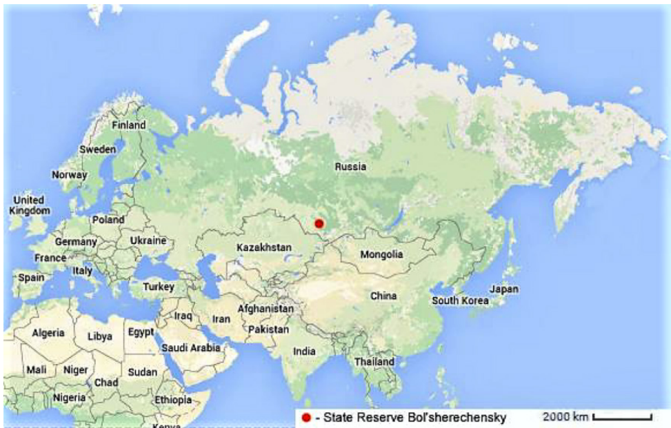
Figure 1. Location of the Bolsherechensky State Nature Reserve.

The increasing development of the Upper Ob forest massif in Altai Krai through forestry, agriculture, and tourism has led to changes in natural complexes and consequent impacts on the avifauna (Poyarintsev et al. 2016; Vazhov et al. 2021; Demidovich et al. 2021). Specially protected natural areas, such as wildlife sanctuaries, are established to conserve pristine areas of nature and therefore necessitate research. Birds play a crucial role in forest ecosystems, as they are highly responsive to environmental changes and can serve as valuable bioindicators of ecosystem health (Vazhov et al. 2021; Kovaleva et al. 2021). However, the avifauna in some specially protected natural areas of Altai Krai, such as the Bolsherechensky State Nature Reserve, has not been adequately studied (Fig. 1). Previous studies have provided limited information, consisting mainly of scattered bird sightings without specific location details or abundance estimates (Chupin, Petrov 2005; Zakaznik 2009; Vazhov 2015). Even the regional Red Data Book lacks sufficient information on rare bird species in the reserve (Red Data Book 2016).