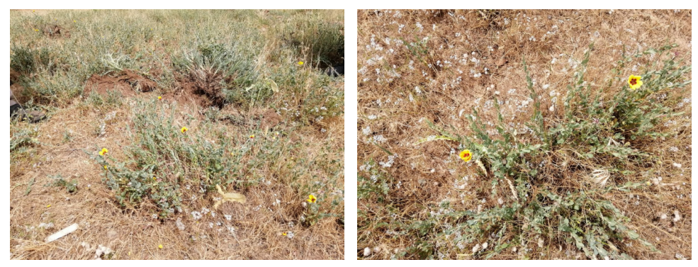
Figure 1. Plant Hultemia persica , nesting and mud wrapping of termites around this plant in natural areas.

Termites did not come as actively to the feed soaked in the extract obtained from the stem of the Persian hultemia, Hultemia persica , i.e., more than the control, consumed less than in the above tests (50%).