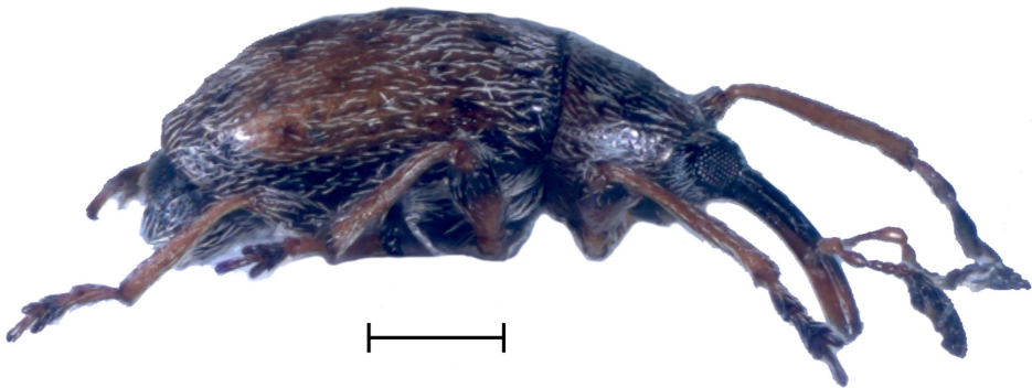
Figure 2. Dieckmanniellus nitidulus from Altaiskii Krai, male, lateral view. Scale bar 0.2 mm.