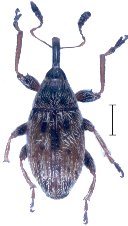
Figure 1. Dieckmanniellus nitidulus from Altaiskii Krai, male, dorsal view. Scale bar 0.2 mm.