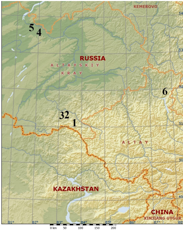
Figure 1. Sample collection site map. 1–6 – number of sample sites.