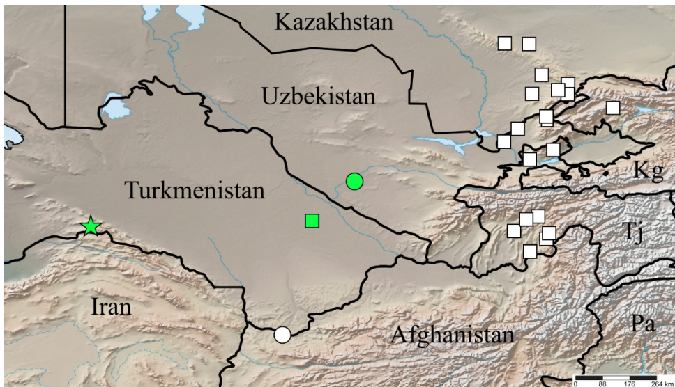
Figure 1. Distribution of Geophilus lindbergi (Loksa, 1971) (oval), Stenotaenia sp. (star), and Krateraspis meinerti (Sselivanoff, 1881) (square) in Middle Asian countries. Kg – Kyrghyzstan, Pa – Pakistan, Tj – Tajikistan. White color – previous records, green one – new data.

Abbreviations: coll. – collector, fragm. – fragment, ZISP – Zoological Institute of the Russian Academy of Sciences, Saint Petersburg.