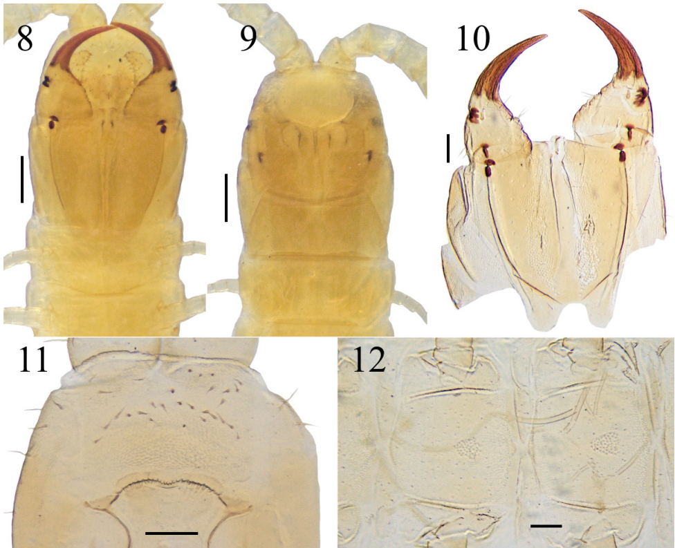
Figures 8–12. Stenotaenia sp.: 8, 9 – front body fragment, ventrally and dorsally; 10 – forcipules, ventrally; 11 – clypeus and labrum, ventrally; 12 – 6–7th segments, ventrally. Scale: 0.1 mm (10–12), 0.2 mm (8, 9).