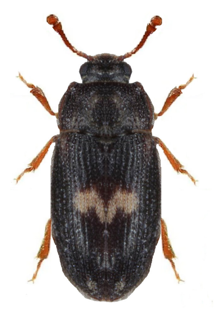
Figure 1. Biphyllus lunatus , habitus. Central Kazakhstan.

Note. The species was found along with lined flat bark beetles (Laemophloeidae) – Placonotus testaceus (Fabricius, 1787), pleasing fungus beetles (Erotylidae) – Dacne bipustulata (Thunberg, 1781), Triplax russica (Linnaeus, 1758) and hairy fungus beetles (Mycetophagidae) – Litargus connexus (Geoffroy, 1785), Mycetophagus multipunctatus Fabricius, 1792, for which the Ulytau Oblast is also a new distribution records in Kazakhstan (Temreshev 2011; 2019; 2022; 2023b).