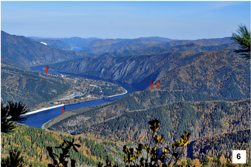
Figures 5–6. Habitats of V. atalanta : 5. Tajikistan, Bartang Valley; 6. Krasnoyarsk Territory and Khakassia Republic, Yenisei Valley.