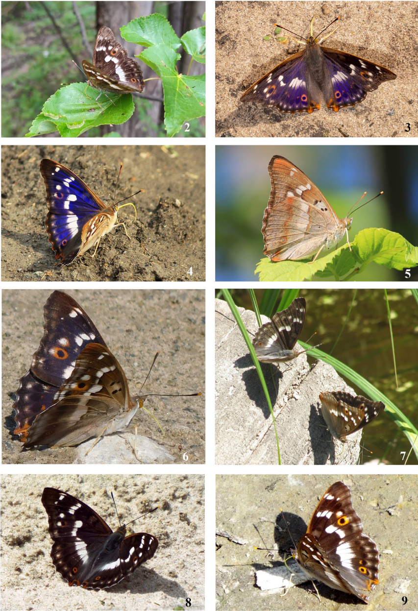
Figures 2–9. 2. Apatura ilia, ♂, an imago in nature, feeding on the wine baits sprayed on the leaves of Tilia cordata, Omsk Region, Ust`-Ishimskiy district, Ust`-Ishim village vicinity, 23.VII.2023, 3. Apatura ilia, ♂, an imago in nature, Kurgan Region, Kurgan district, Keramzitniy village vicinity, 55.409905 N, 65.458464E, 22.VIII.2020, 4. Apatura ilia, ♂, an imago in nature, Kurgan Region, Shadrinskiy district, Glubokoe village vicinity, 56.202546 N, 63.737416 E, 9.VII.2017, Continued on the next page.