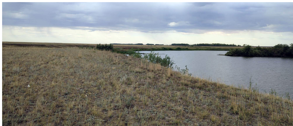
Figure 2. Habitat of Hydraecia osseola , Euxoa hastifera , Agrotis robusta . Omsk region, Russko-Polyansky district, 8 km SW of Khlebodarovka vill., river Tleusai, 26.VIII.2023.