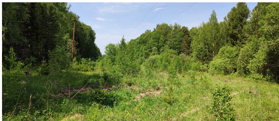
Figure 1. Habitat of Horisme aemulata , Herminia grisealis . Omsk region, Ust'-Ishimsky district, 3 km NW of Bol'shaya Bitcha village, 7.VI.2023, photo by S.A. Knyazev.

Solenoye (Fig.5) – Karasuk district, Lake Solenoye, east of the village Khorosh-eye, 53°33'59.86"N, 78°36'08.81"E.