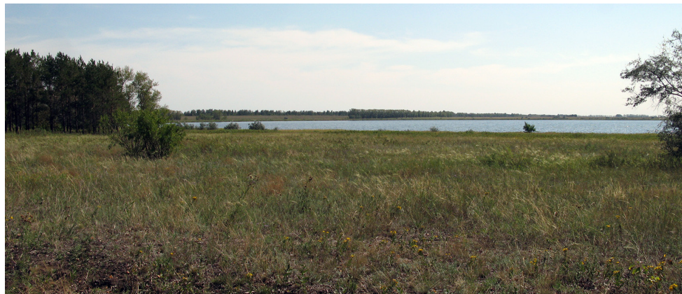
Figure 5. Habital of Agrotis robusta . Novosibirsk region, Karasuk district, Lake Solenoye, east of the village Khorosheye, 22.VIII.2023, photo by V.V. Ivonin.

Remark. New to Novosibirsk Region. New locality in Omsk region. In Western Siberia it is previously known from Omsk region (Knyazev et al. 2010; Knyazev 2020) and from Altai Territory (Volynkin 2012).