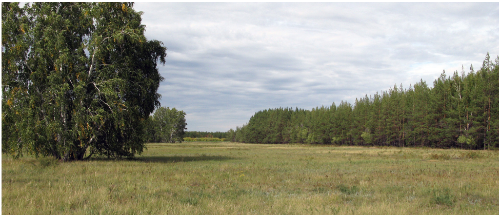
Figure 4. Habitat of Phaiogramma etruscaria , Agrotis robusta . Novosibirsk region, Karasuk district, 3,5 km South of Oktyabrskoye village, 2. XI.2023, photo by V.V. Ivonin.