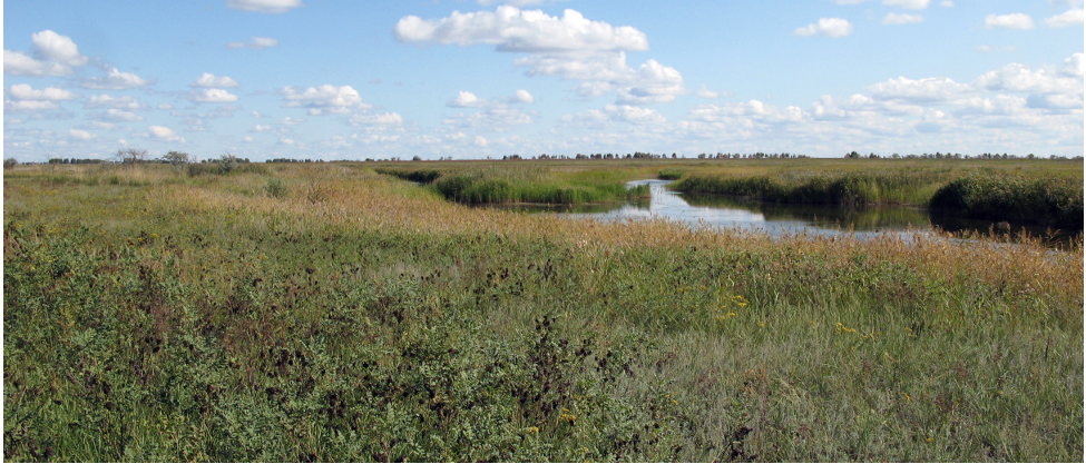
Figure 3. Habitat of Phaiogramma etruscaria , Hydraecia osseola . Novosibirsk region, Karasuk district, Burla river valley southwest of Khoroshoe village, 9.IX.2023, photo by V.V. Ivonin.