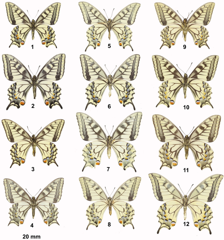
Figure 2. Papilio machaon , adult specimens, under side. See description to the Fig. 1.

12 – P. m. oreinus , female, Kyrgyzstan, Tian-Shan Mts., Kazarman vic., 1800 m, 20–21.06.2016, S. Churkin leg.