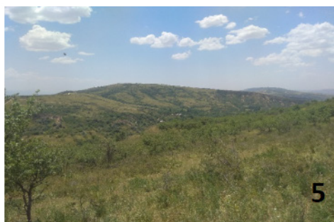
Figures 2–5. Collection points in the Hazratisho Ridge. 2 – Emom–Askari Mountain; 3 – Childukhtaron Nature Reserve; 4 – Kozii Yaktefa gorge; 5 – Tiyun pass.