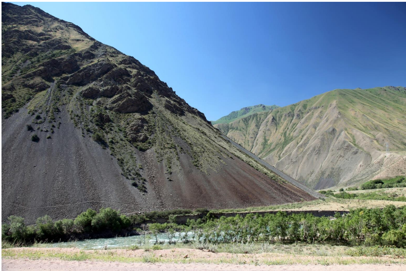
Fig. 5. Central part of Dzhumgaltoo Mts. near Aral, huge screes are biotopes of Paralasa kusnezovi (Avinov, 1910).