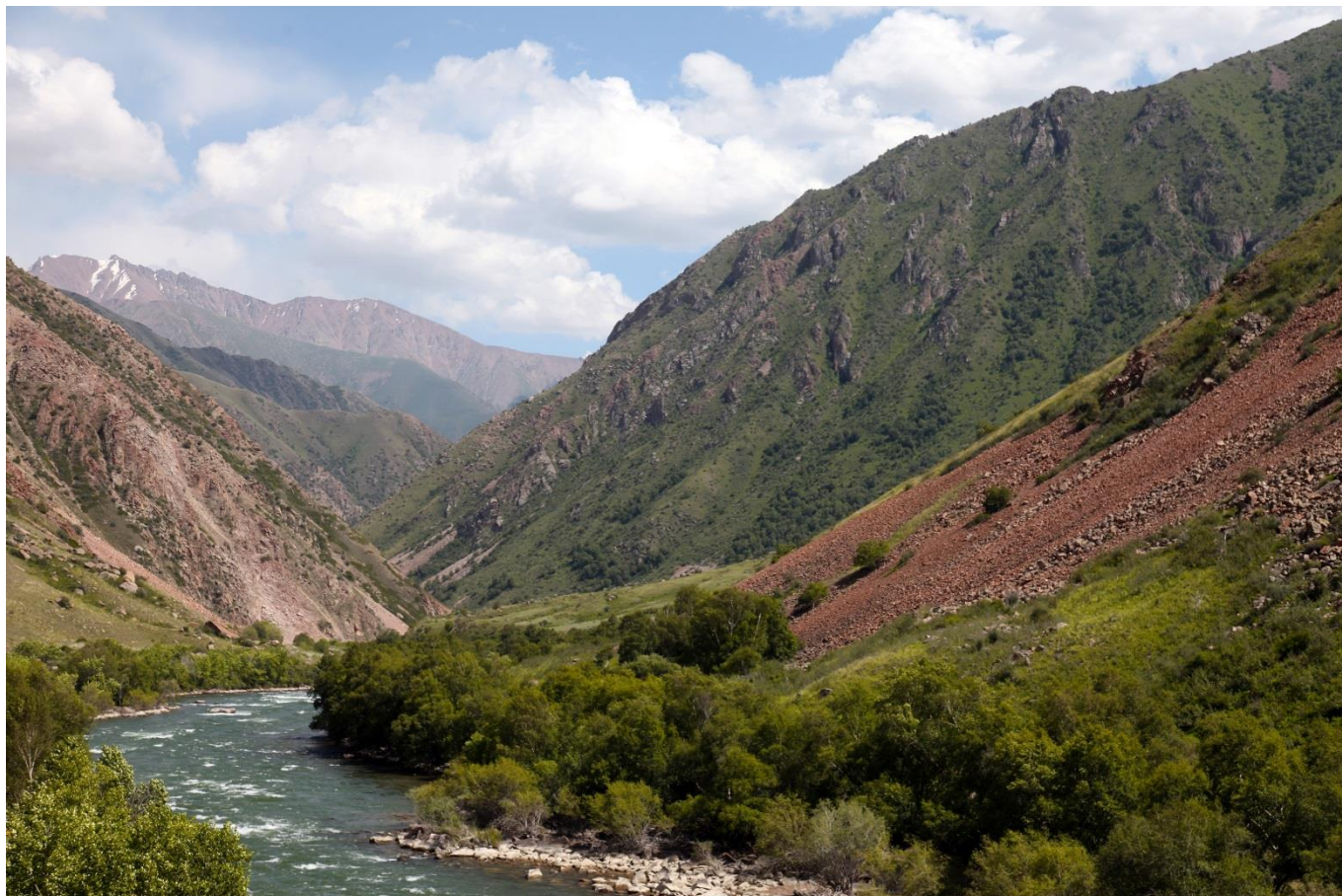
Fig. 3. Kekemer river 3 km N of Sary-Oi, left side – Dzhumgaltoo Mts., right side – Sususamyr-Too Mts.