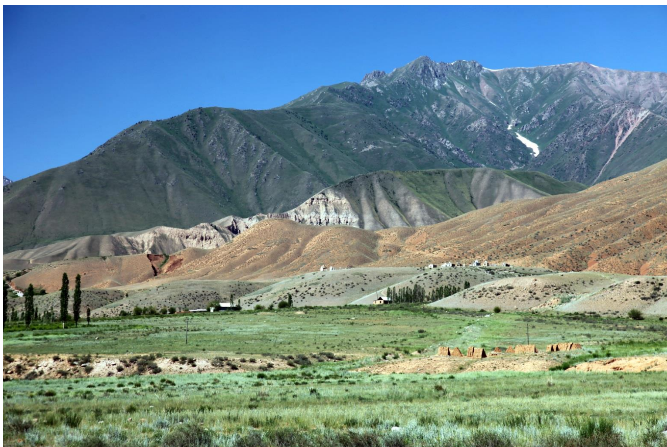
Fig. 4. Central part of Dzhumgaltoo Mts. near Sary-Oi, almost all vertical zones are visible.