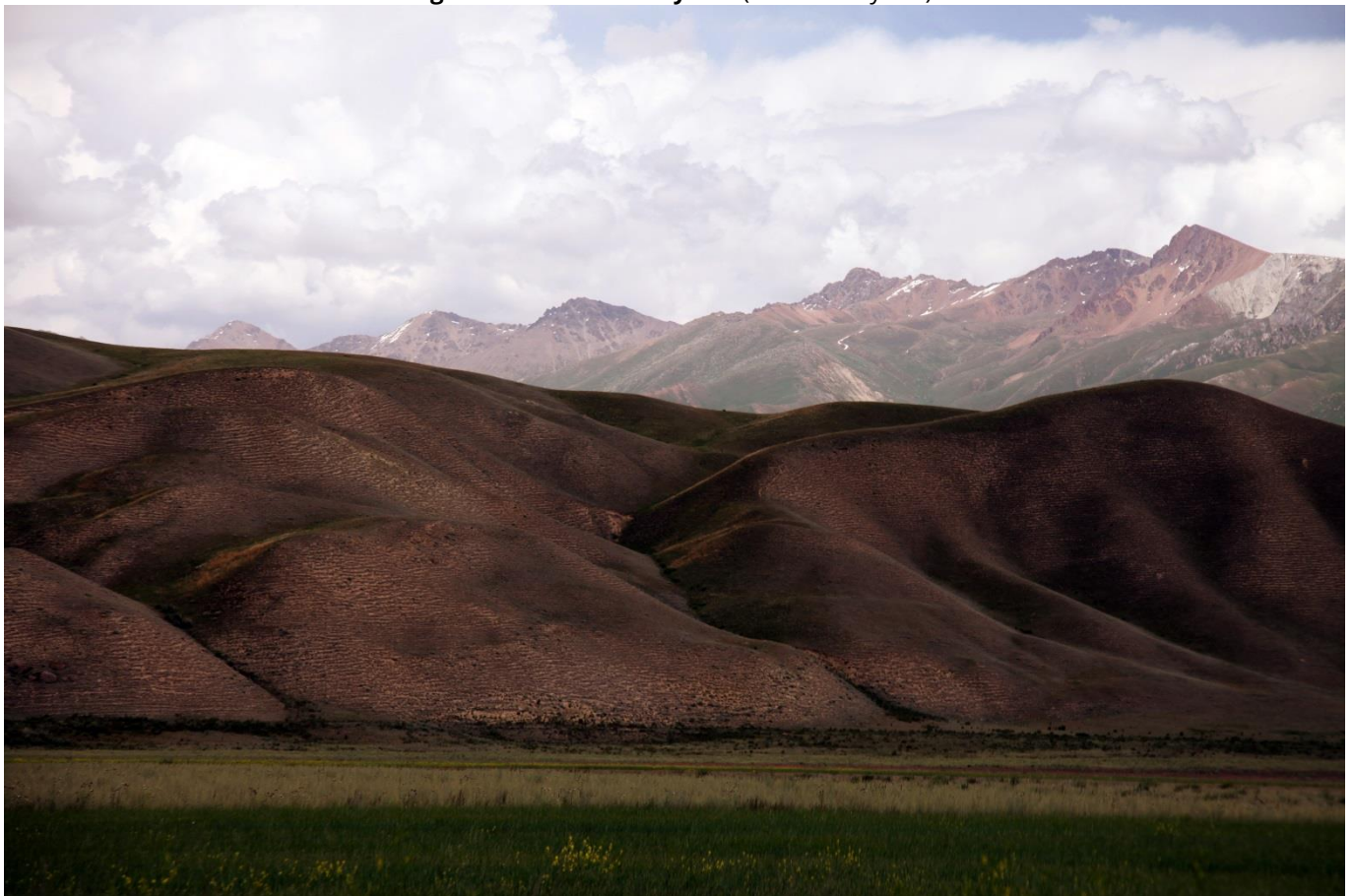
Fig. 2. North-western part of Dzhumagaltoo Mts. near Kozhomkul village (Sary-Kayky mountain gorge), about 2000 m. Typical biotope of Syrichtus antonia , Pyrgus sidae , Parnassius apollonius , Driopa mnemosyne , Colias erate , Pontia daplidice , Disommata nolkeni , Chortobius pamphilus , Melitaea minerva , M. kotschubeji , Phengaris cyanecula , Afarsia sieversi .