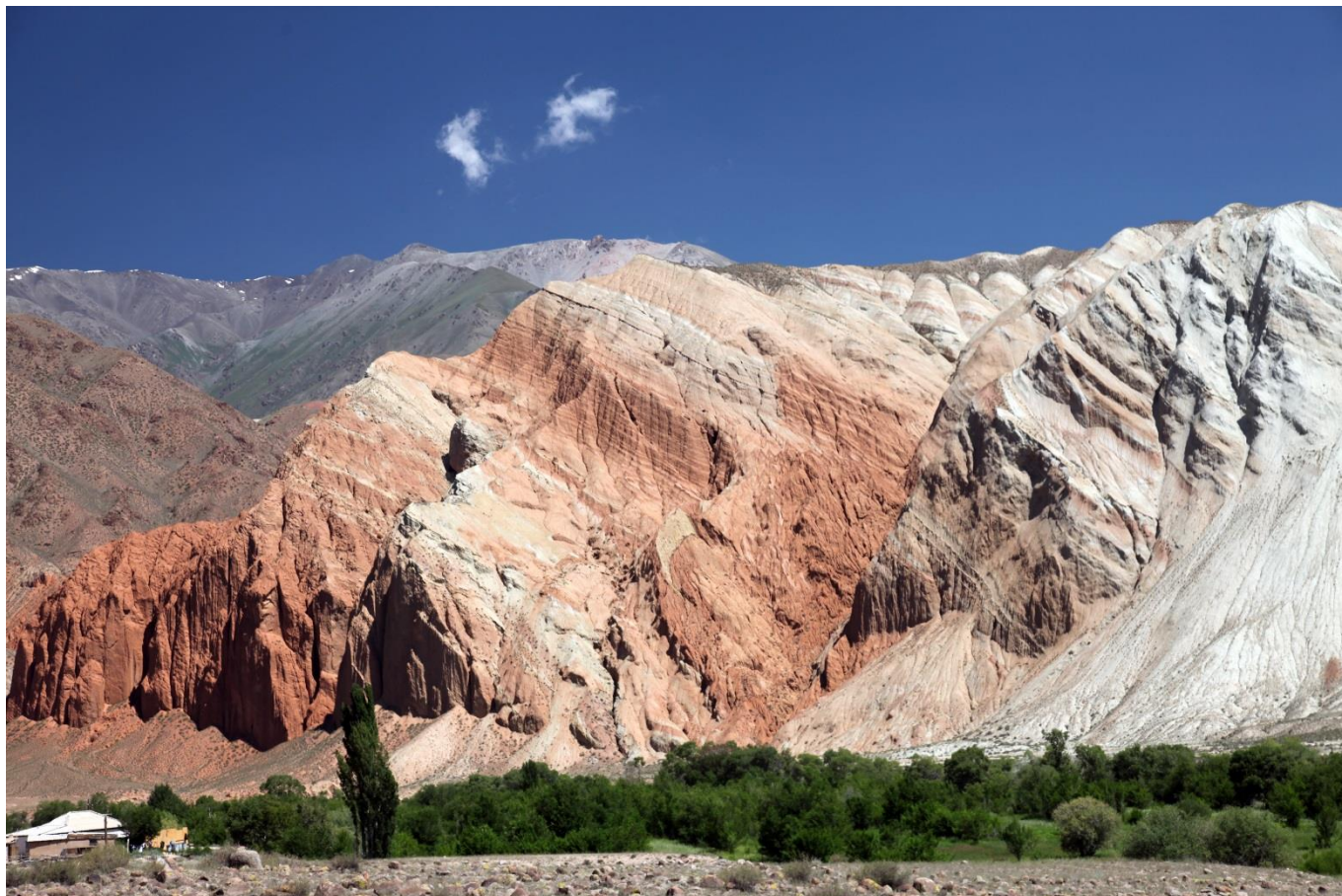
Fig. 7. Eastern spurs of Dzhumgaltoo Mts., Seuk river valley, Seuk village. Typical biotope of various Lycaenids ( Polyommatus icarus , P. icadius , Rueckbeilia fergana etc.).