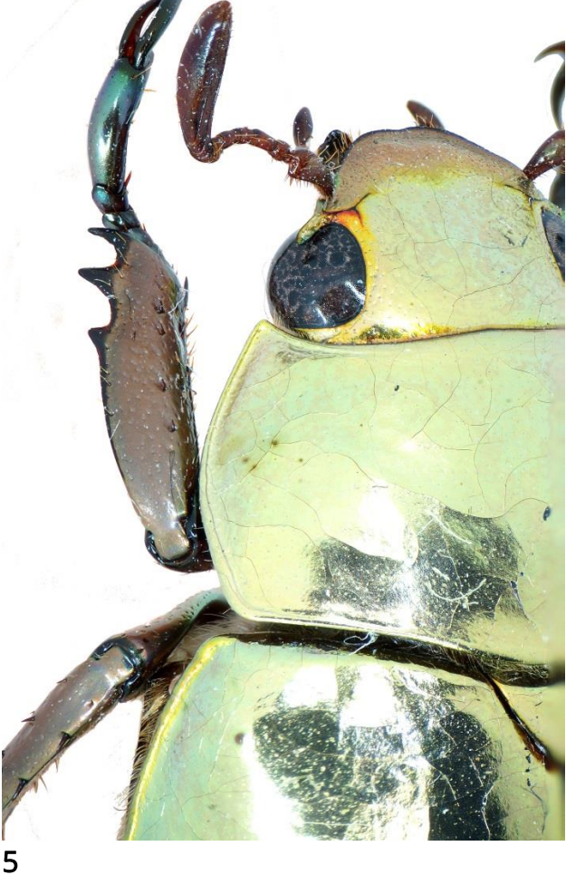
Fig. 4-5. 4. C. kalinini sp.n., male Holotype: pronotum (BOLD sample ID BC-lvsh-5482-X23); 5. C. resplendens, male: pronotum