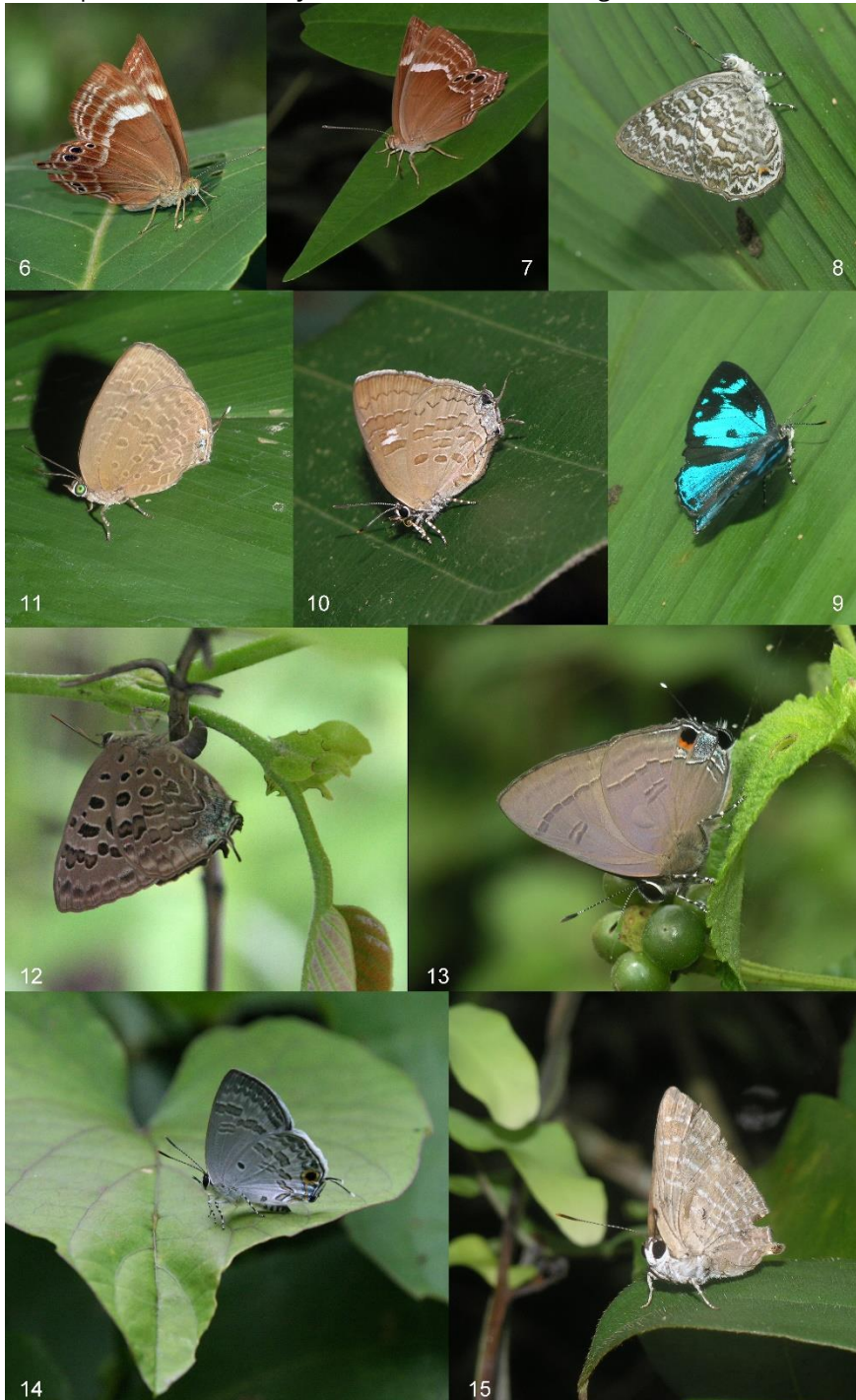
Figs. 6-15 New for Cambodia or provisionally identified Lycaenidae (Riodininae, Poritinae and Theclinae) from Eastern Cambodia: 6 – Abisara cf. bifasciata angustilineata , ♂, 71\Veal Rum Plang , 07.06.2013; 7 – A. latifasciata , ♂, below 95\Buu Sraa Waterfall , 12.06.2014; 8-9 – Poritia cf. hewitsoni , ♂, 81\Monorom tributary , 13.06.2014; 10 – Ahmetia achaja achaja , ♀, 75\Kong Kreav Veal , 04.01.2013; 11 – Arhopala elopura ssp., below 95\Buu Sraa Waterfall , 12.06.2014; 12 – A. nicevillei , ♀, 90\Pulung River , 25.06.2018; 13 – Rapala manea schistacea , ♂, 80\Monorom Waterfall , 13.06.2014; 14 – Sinthusia chandrana grotei , 79\O'Romis , 28.06.2018; 15 – Virachola sp. cf. kessuma , 88\Dak Dam (a tall Cyperus swamplet), 16.06.2014. Not to scale.

* Arhopala nicevillei Bethune-Baker, 1903 ♂♂ – Mo: ♀, 90\Pulung River , 25.06.2018 (Fig. 12). The female laid eggs on young sprouts of low dipterocarp trees, each time by one or few and then changed a tree.