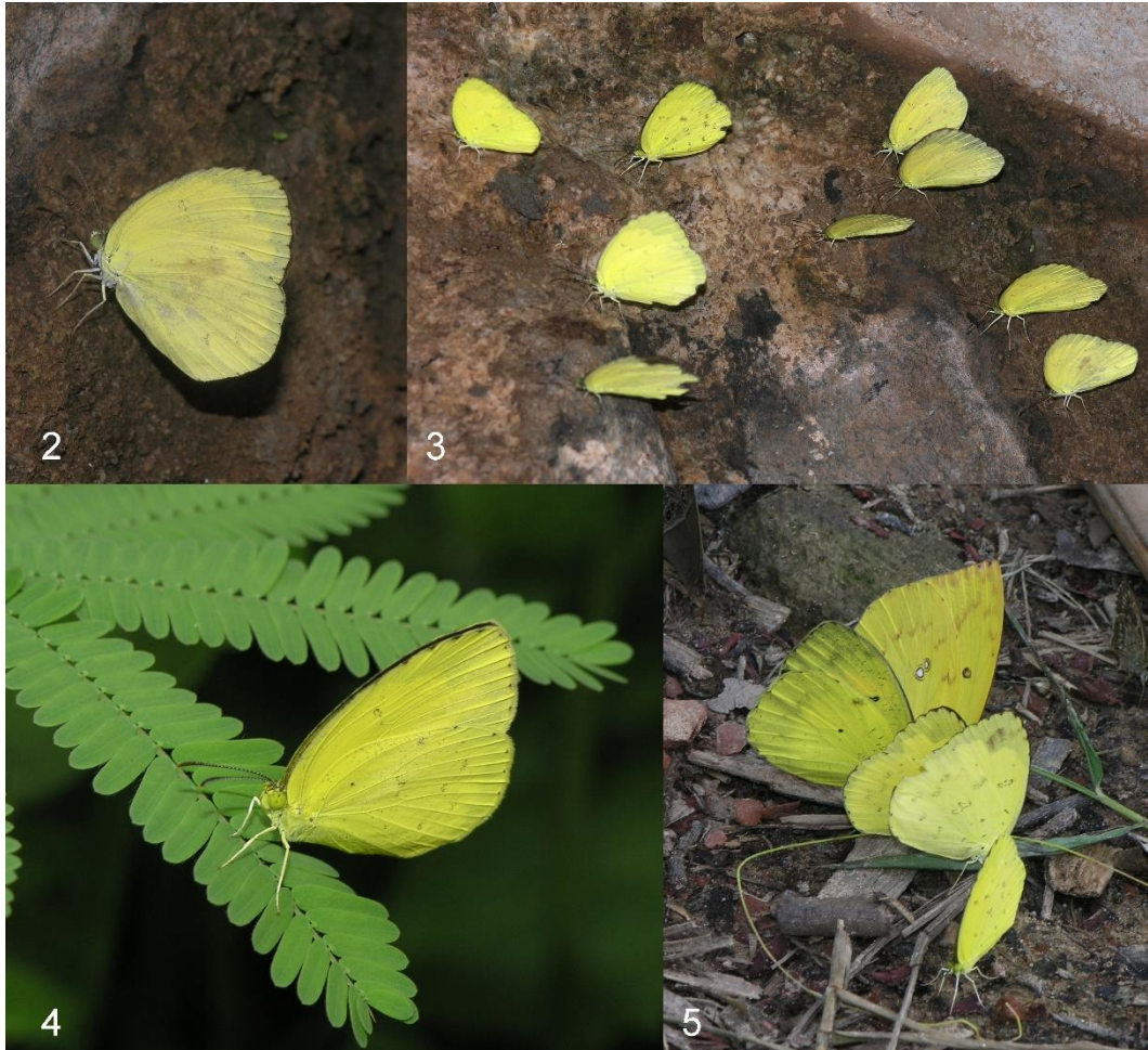
Figs. 2-5 Problematic Eurema spp. from eastern Cambodia: 2 – E. hecabe hecabe , a male with reduced UNS dark markings, 76\Lowest river , 17.06.2014; 3 – similar males in a company with those with normally developed UNS marking in the same place; 4 – Eurema sp. with only apical comma-like spot in cell, 73\Yorn village , 5.06.2013; 5 – a similar male (below) in a company of two males of E. hecabe hecabe (in the centre), and also a male of Ixias pyrene verna and a female of Catopsilia pomona pomona f. pomonai in the same place. Not to scale.

in the UNF cell. They occurred together with regular specimens with usual markings (Fig. 3) and could represent a different seasonal cohort.