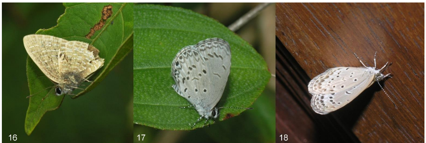
Figs. 16-18 Polyommatainae from eastern Cambodia (a provisionally identified, an unidentified and a new for Cambodia): 16 - Nacaduba cf. beroe gythion , 82\Sen Monorom W suburbs , 11.06.2014; 17 - Udara/Celastrina sp., 88\Dak Dam (a tall Cyperus swamplet), 16.06.2014; 18 - Zizeera maha maha , 87\Long Vibol Guesthouse , 7.06.2014. Not to scale.

* Zizeera maha maha (Kollar, 1848) ♂ - Mo: 87\Long Vibol Guesthouse , 7.06.2014 (Fig. 18).