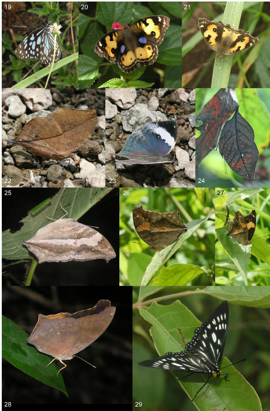
Figs. 19-29 Nymphalidae (Danainae, Nymphalinae, Heliconiinae and Apaturinae) new for Cambodia: 19 - Tirumala limniace limniace , 93\Far river', 26.06.2018; 20-21 - Junonia hierta hierta : ♀♀, 20 - 66\Lake Kan Seng, 31.05.2013, 21 - below the lower tile of 95\Buu Sraa Waterfall, 4.08.2016; 22-24 - Kallima inachus alboinachus : 22-23 - ♂♂, 93\Far river', 26.06.2018, 24 - ♂, 96\Loringae brook, 24.06.2018; 25-27 - Yoma sabina vasuki : 25 - above 95\Buu Sraa Waterfall, 4.08.2016, 26-27 - 93\Far river', 26 and 27.06.2018; 28 - Terinos clarissa falcata , ♂, 67\Lake Yak Lom, 6.06.2013; 29 - Euripus nyctelius nyctelius , ♂, 82\Sen Monorom W suburbs, 11.06.2014. Not to scale.