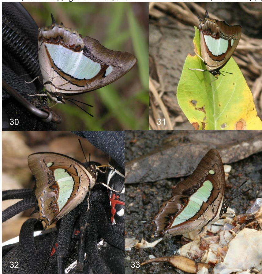
Figs. 30-33 Both Polyura arja arja (30-31) and Polyura athamas athamas (32-33) photographed in two localities of eastern Cambodia: : 74\Yak Kae Rivulet , 4.06.2013 (30, 32) and 93\Far river , 27.06.2018 (31, 33). Not to scale.

Polyura athamas athamas (Drury, [1773]) ♂ - Ra: 71\Veal Rum Plang , 07.06.2013; 74\Yak Kae Rivulet , 4.06.2013 (Fig. 32). Mo: ♂, 93\Far river , 27.06.2018 (Fig. 33). This species was distinguished from the previous one by a narrower subapical spot and the upper end of the pale band on UNF, as illustrated by two pairs of photos of both species met together at Yak Kae Rivulet in Ratanakiri (4.06.2013) (Figs 30 and 32) and Far River in Mondulkiri (27.06.2018) (Figs 31 and 33).