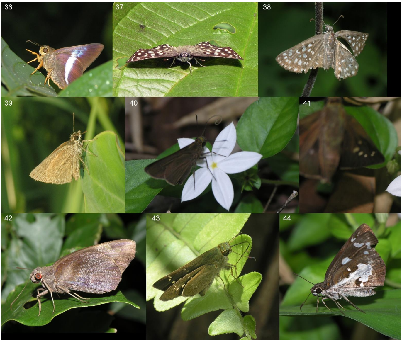
Figs. 36-44 HesperIIDae, new for Cambodia or provisionally identified: 36 – Bibasis sena sena , 73\Yorn village , 4.06.2013; 37 – Caprona agama agama , 69\Cha Ong Waterfall , 31.05.2013; 38 – Caprona alida alida , 84\Sen Monorom brook , 8.06.2014; 39 – Aeromachus cf. pygmaeus , 86\Sen Monorom ponds , 8.06.2014; 40-41 – ? Caltoris sp., Ra: 67\Lake Yak Lom , 30.05.2013; 42 – Gangara thyrasis thyrasis , 73\Yorn village , 4.06.2013; 43 – Pelopidas cf. mathias mathias , 95\Buu Sraa Waterfall (in spre y area just below the upper tile), 4.08.2016; 44 – Udaspes folus , 67\Lake Yak Lom , 30.05.2013. Not to scale.

Ancistroides nigrita maura (Snellen [1880]) ♂ – Mo: 95\Buu Sraa Waterfall (at headquarters), 3.08.2016.