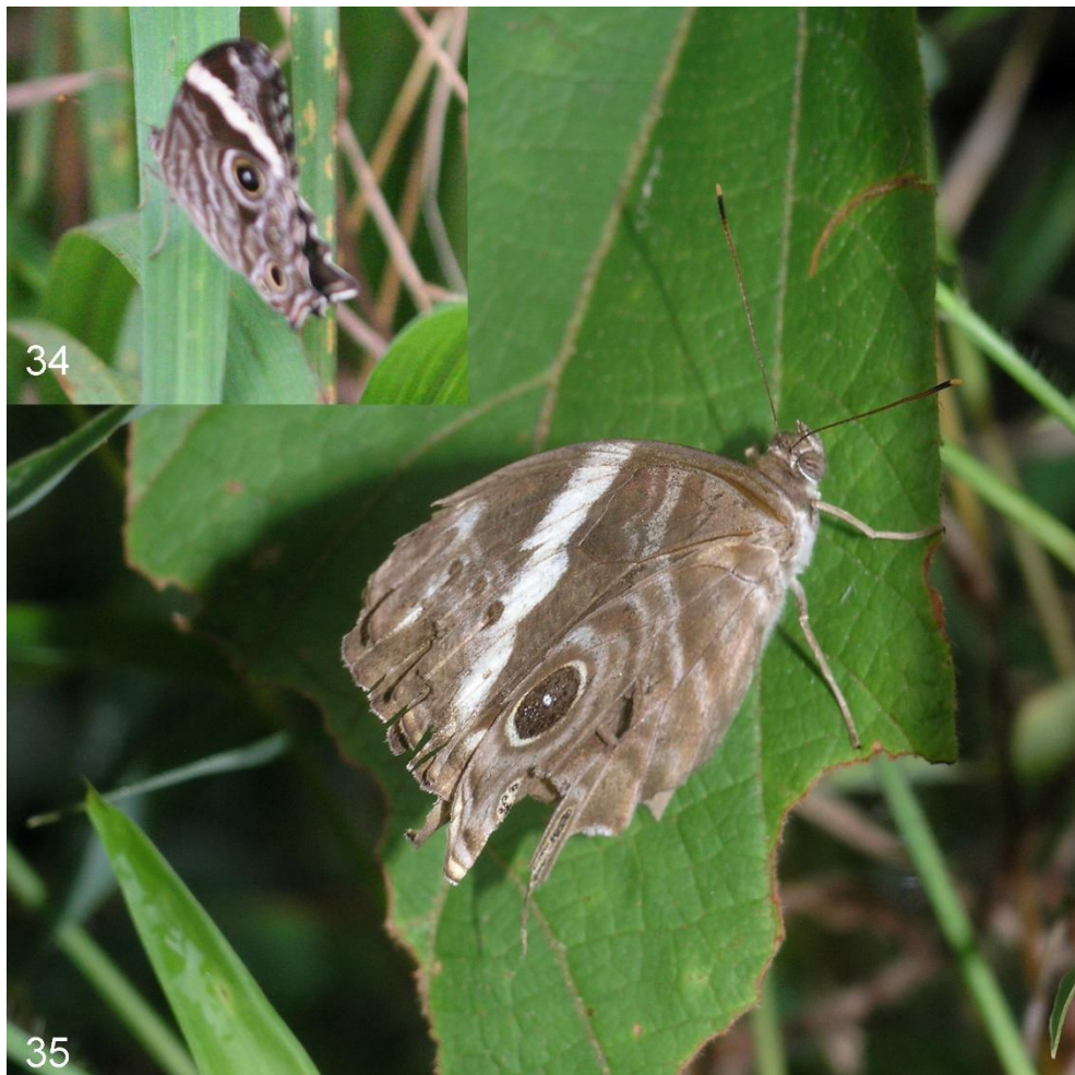
Figs. 34-35 Females of Lethe rohria rohria , new for Cambodia, in Mondulkiri Province: 34 - 85\2.5 km SE of Sen Monorom , 23.06.2018; 35 - 88\Dak Dam , 16.06.2014. Not to scale.

* Lethe rohria rohria (Fabricius, 1787) ♀ - Mo: ♀, 85\2.5 km SE of Sen Monorom , 23.06.2018 (Fig. 34); ♀, 88\Dak Dam , 16.06.2014 (Fig. 35).