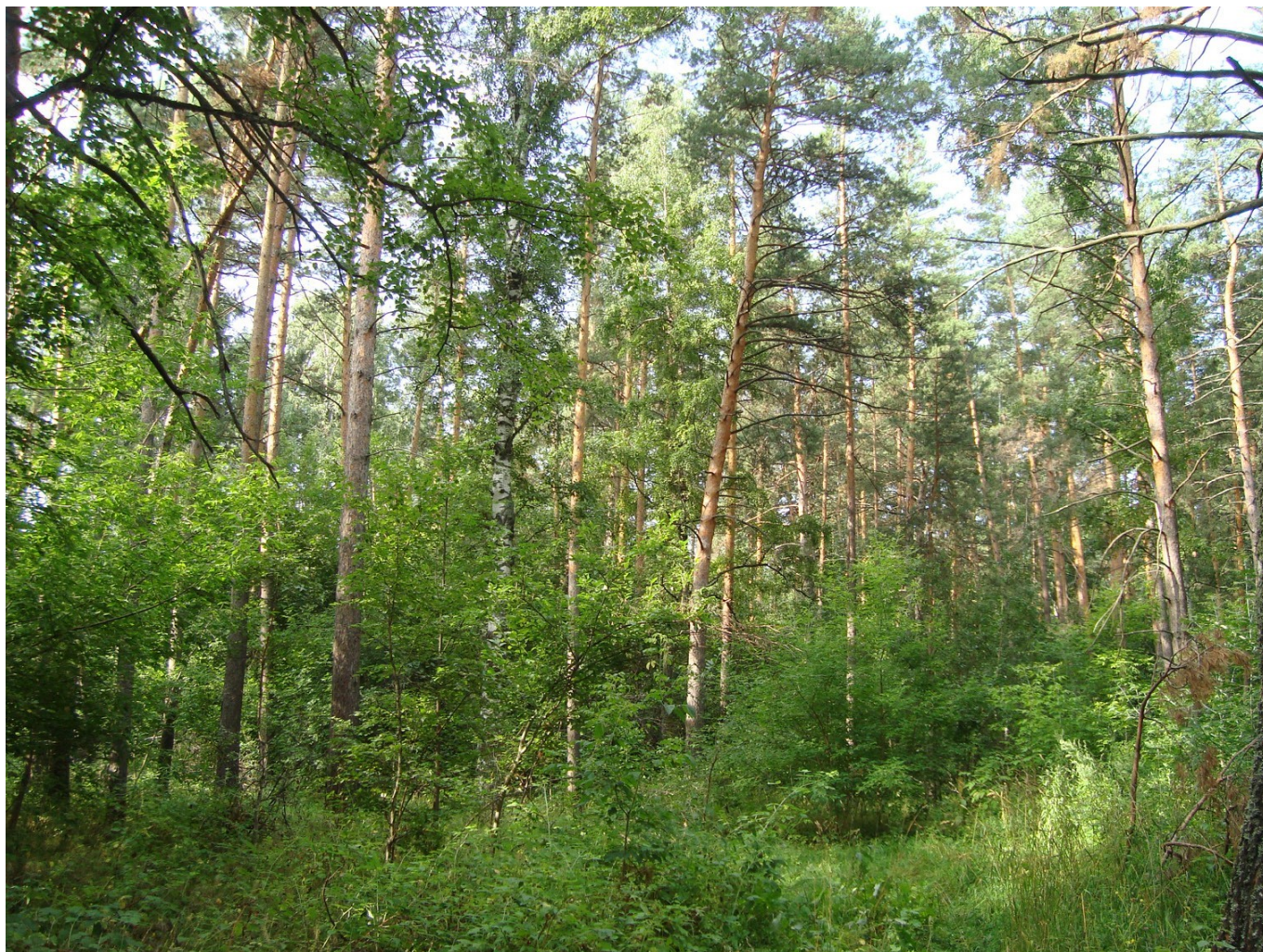
Figure 2. Pine-maple forest with horsetail-sweetroot grass cover.

The total projective cover of the herbaceous layer is 40%. The dominants of the herbaceous layer are the following: Equisetum hiemale , Osmorhiza aristata . The grass stand is two-layered. The first sublayer is 65 cm high and is formed by Osmorhiza aristata , Arabis pendula L., Urtica dioica and others. The second sublayer is 35 cm high and is formed by Equisetum hiemale , Pulmonaria mollis , vegetative shoots of Angelica sylvestris . Grasses and legumes are absent. The forbs are represented by 10 species of plants: Viola mirabilis , Pulmonaria mollis , Osmorhiza aristata , Arabis pendula , Urtica dioica , Glechoma hederacea L., Impatiens parviflora , Angelica sylvestris , Equisetum hiemale , Dryopteris carthusiana . In total, 15 species of higher vascular plants were noted per 400 m 2 .