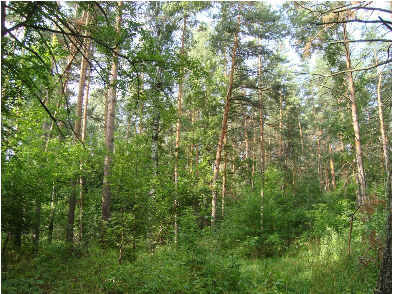
Figure 2. Pine-maple forest with horsetail-sweetroot grass cover.

The total projective cover of the herbaceous layer is 40%. The dominants of the herbaceous layer are the following: Equisetum hiemale , Osmorhiza aristata . The grass stand is two-layered. The first sublayer is 65 cm high and is formed by Osmorhiza aristata , Arabis pendula L., Urtica dioica and others. The second sublayer is 35 cm high and is formed by Equisetum hiemale , Pulmonaria mollis , vegetative shoots of Angelica sylvestris . Grasses and legumes are absent. The forbs are represented by 10 species of plants: Viola mirabilis , Pulmonaria mollis , Osmorhiza aristata , Arabis pendula , Urtica dioica , Glechoma hederacea L., Impatiens parviflora , Angelica sylvestris , Equisetum hiemale , Dryopteris carthusiana . In total, 15 species of higher vascular plants were noted per 400 m 2 .