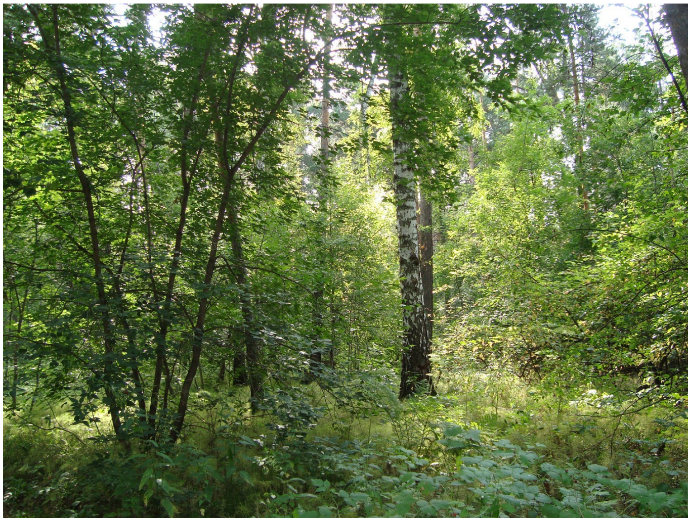
Figure 3. Pine-maple forest with horsetail-sweetroot grass cover.