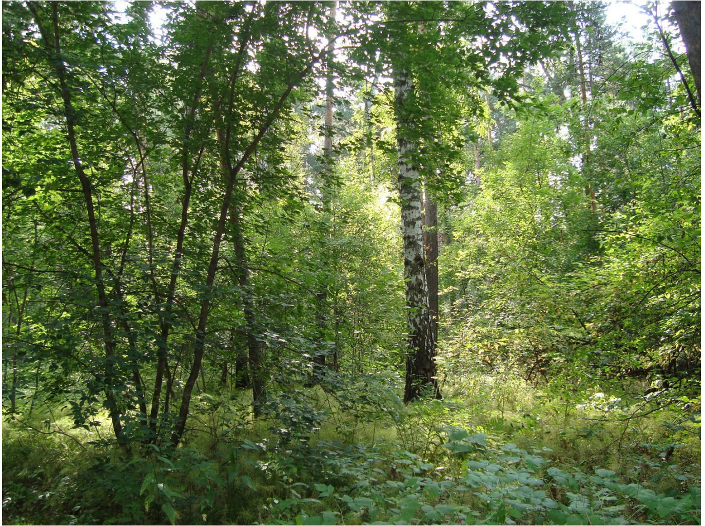
Figure 3. Pine-maple forest with horsetail-sweetroot grass cover.