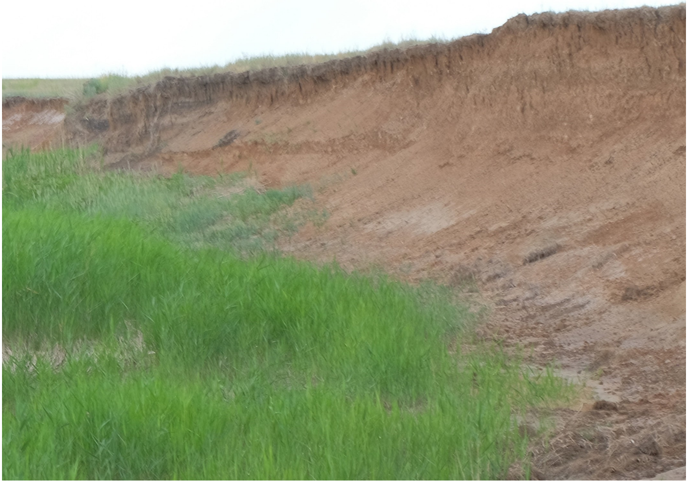
Figure 3. Habitat of Ceutorhynchus rusticus.