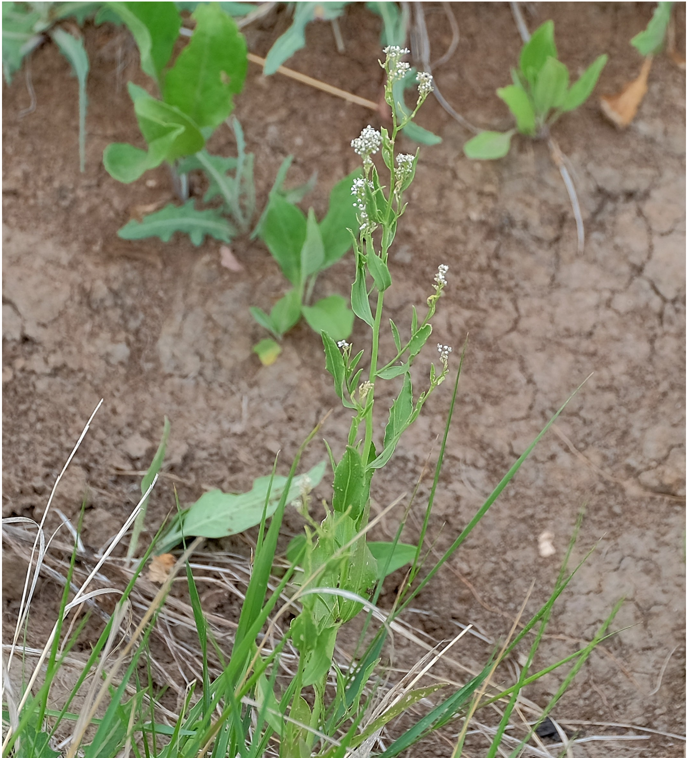
Figure 4. Collection plant of Ceutorhynchus rusticus .