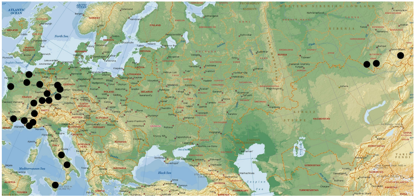
Figure 5. Distribution of Ceutorhynchus rusticus .