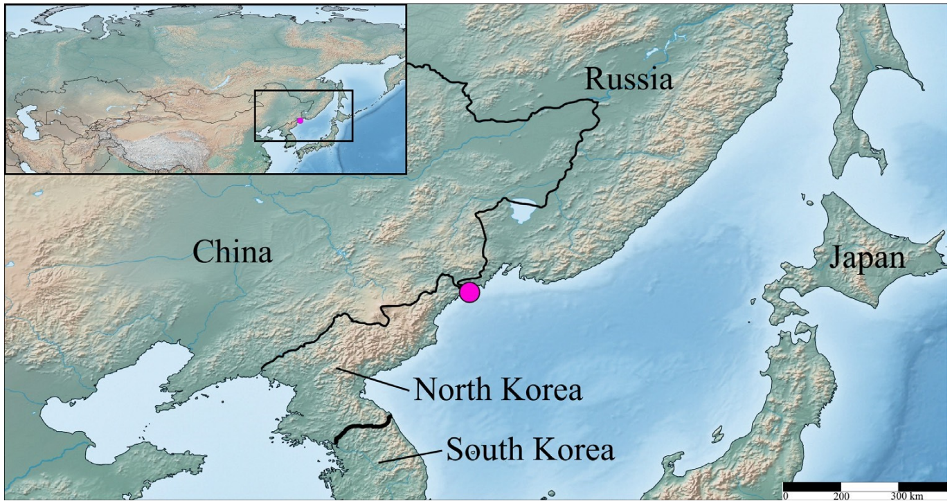
Figure 1. Distribution of Thereuonema tuberculata (Wood, 1862) in Russia.