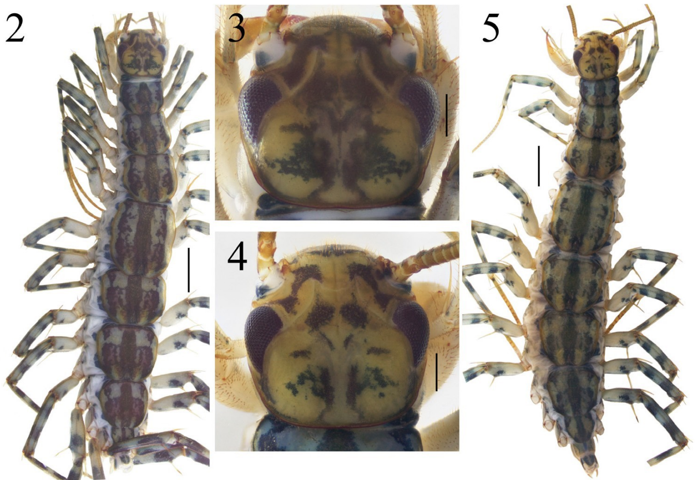
Figure 2. Figures 2-5. Thereuonema tuberculata (Wood, 1862), dorsal view (2, 3 - male, ASU No. 512; 4, 5 - female, ASU No. 508): 2 - habitus of male; 3 - head of male, 4 - head of female, 5 - habitus of female. Scale: 2 mm (2, 5), 0.5 mm (3-4).