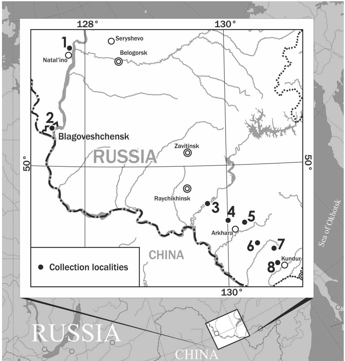
Figure 1. Map of the of collection localities. See the text for designations.

Typification of ranges was carried out on the basis of the zonal-sectoral principles adopted to Far Eastern geometroid moths by Beljaev (2011).