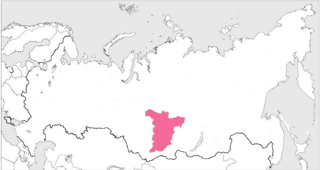
Figure 1. The placement of Khakassia and South of Krasnoyarsk region in Russian Federation, in according to the boundaries marked in the Catalogue of Lepidoptera of Russia (2019) .