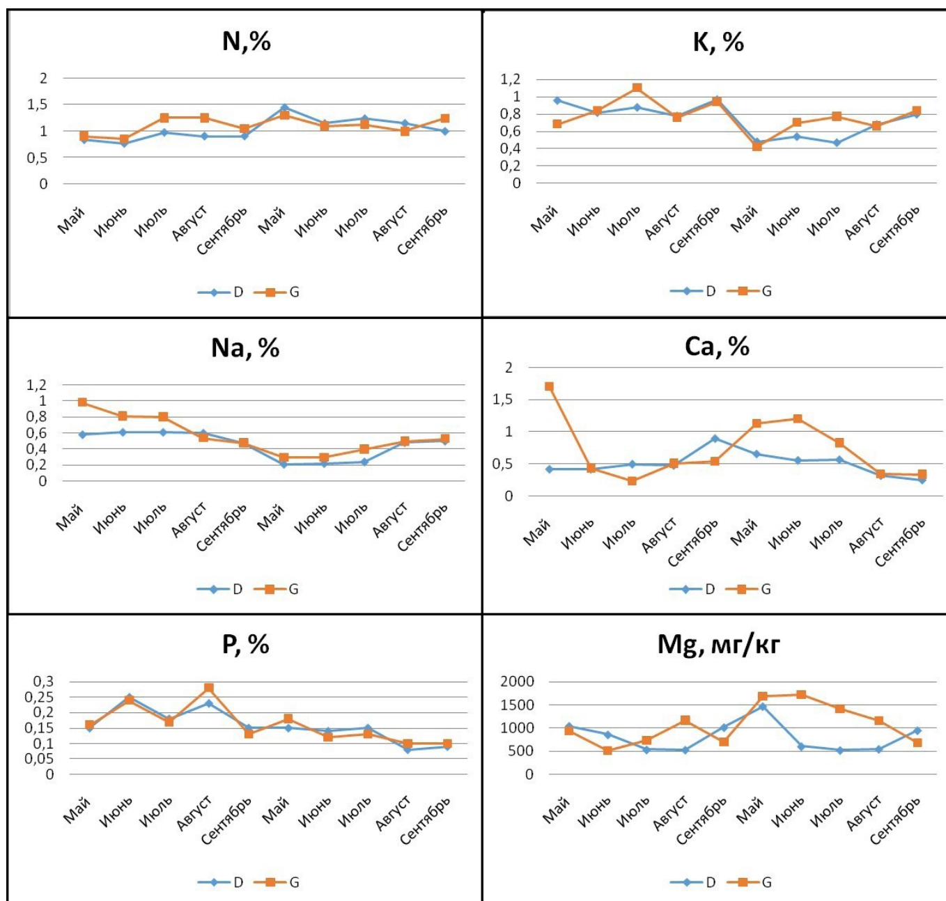
Figure 1. Mineral content in the above-ground phytomass of the forb-fescue-feather grass steppe community ( Stipa zaleskii , S. lessingiana , Herbae stepposae ) with Helictotrichon desertorum and petrophytous elements of the community (6B). G - living above-ground phytomass, D - dead above-ground phytomass.

In 2015, the average Ca concentration in the above groundliving community was lower (0.69%) than the following year (0.77%). The highest Ca concentration for this fraction was observed during the entire observation period in May 2015 (1.7%) (Fig. 1). Atthe beginning of the summer, it had decreased 3.8 times and by mid-summer it had decreased even twice more, reaching its lowest level for the summer (0.24%). The concentration of Ca in the living above-ground phytomass reached its maximum during the vegetation period (1.2%) at the beginning of summer 2016. During the remainder of a vegetation period, a decrease in the element concentration was observed with its minimum in September (0.34%).