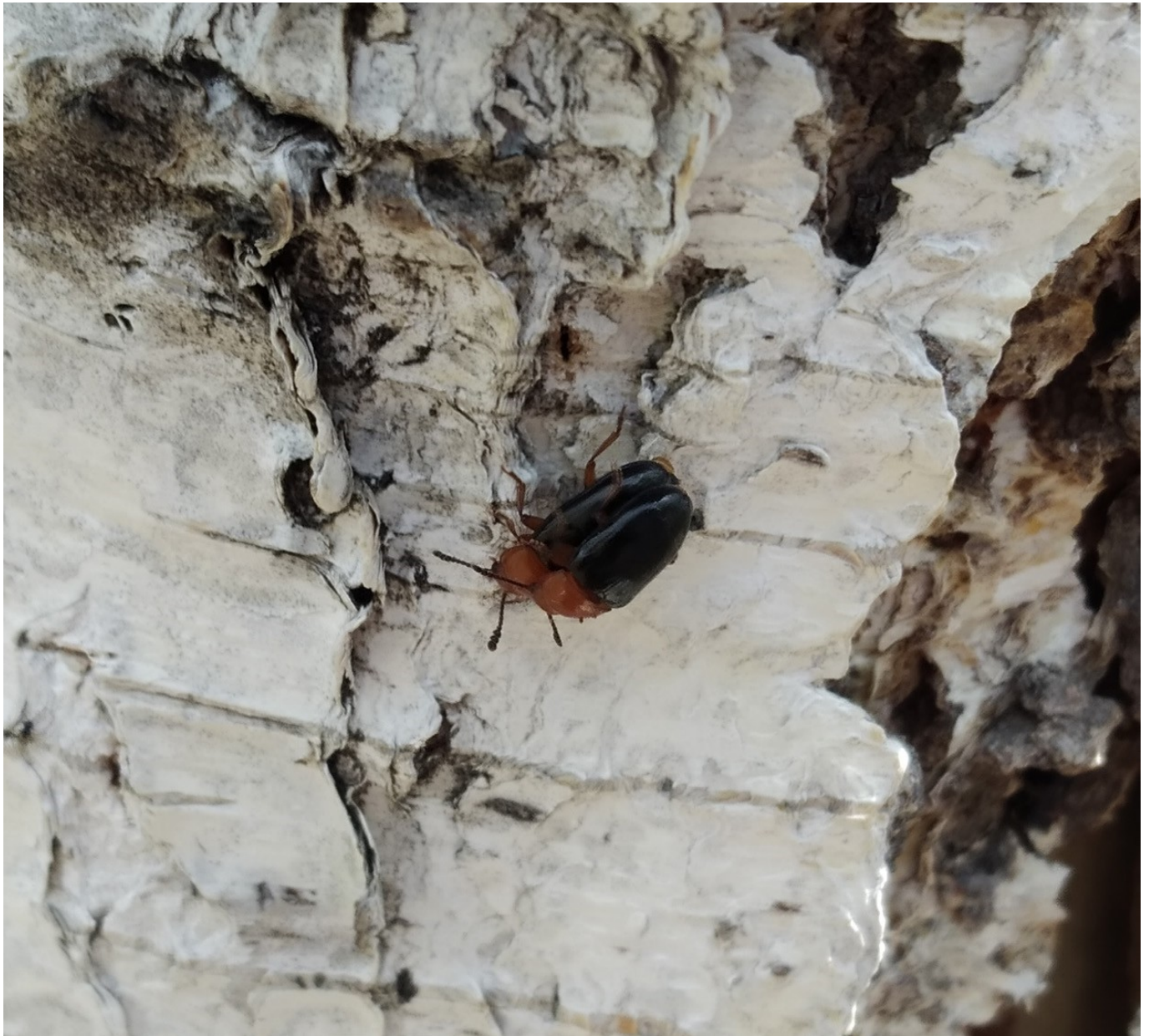
Figure 2. Triplax russica in copula on the bark of dead European white birch Betula pendula , North Kazakhstan.