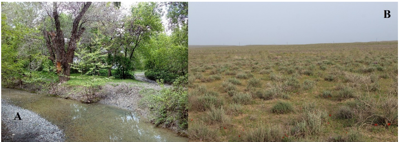
Figure 2. Plain landscapes adjacent West part of Zarafshan ridge (A - Tugai forests in Zarafshan national park (h=700 m); B - Kyzylkum desert (h=300 m).

33. HL - Tajikistan, Sogd region, Khazorchashma lake, 39°5'47.1 N 67°51'1 E, h=2430 m.