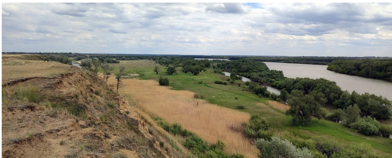
Figure 2. View on the Irtysch river from the right bank, Cherlacksky district, 1 km N of Tatarka vill., 5.VI.2022, photo by S.A. Knyazev.