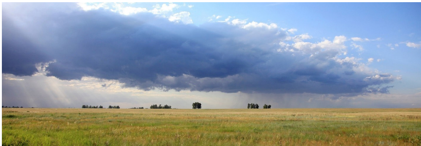
Figure 1. Steppe on the South of Omsk Region, Russko-Polyansky district, 2 km SE of Buzan vill., 22.VI.2018, photo by S.A. Knyazev.