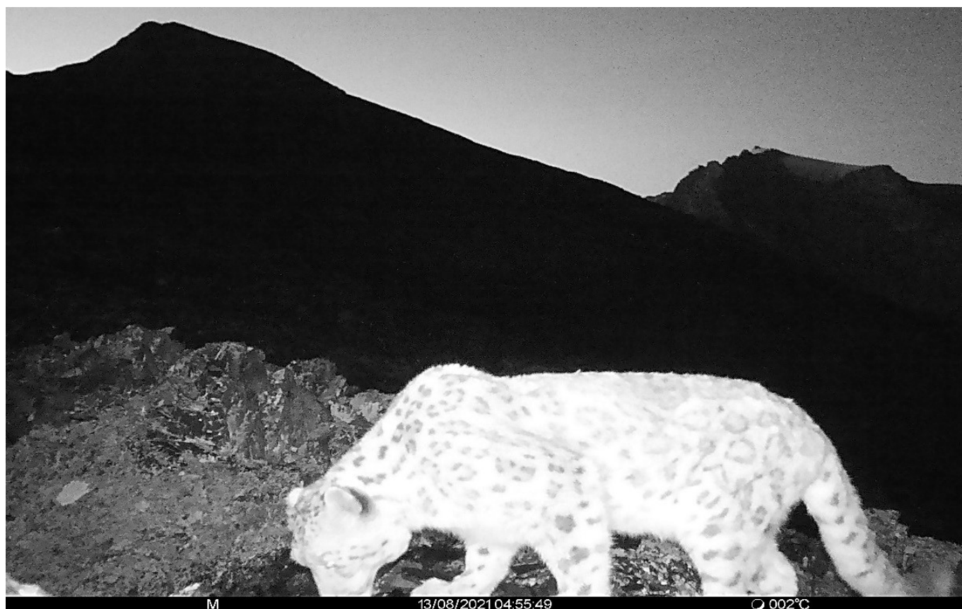
Figure 2. The nocturnal photo of the snow leopard (August 13, 2021, Chikhachev Ridge, Altai Biosphere Reserve).