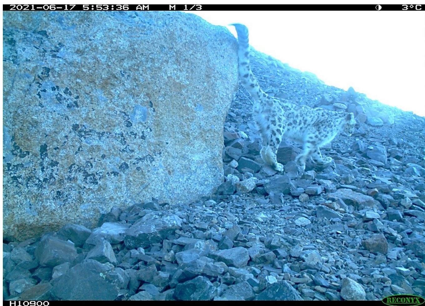
Figure 1. Snow leopard (17 June 2021, Chikhachev Ridge, Altai Biosphere Reserve).

Ounce patrols their area several times a day and marks it with cheek glands (rubbing the vertical objects), interfinger glands (scraping the ground with their hind paws), tree scrapes (clawing trees with their front paws), urine and fecal marks. In a video from August 13, 2021, a male Horgai first sniffed olfactory marks left by other animals and then interspersed them, using the cheek gland and spraying urine.