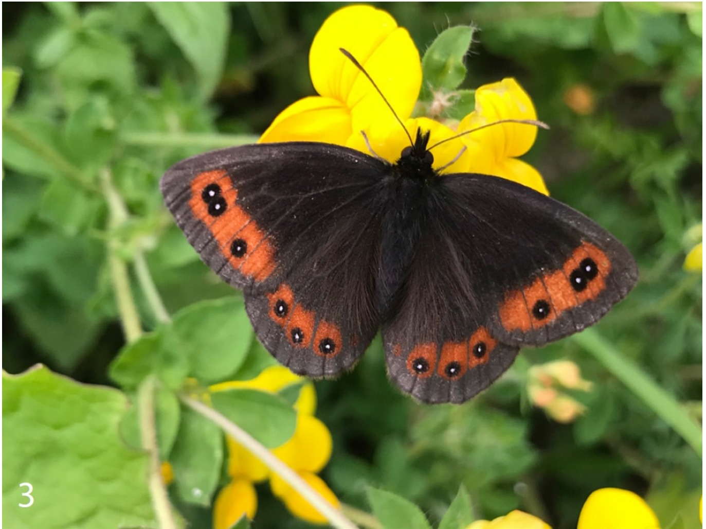
Figure 3. Butterflies of South Ossetia in Nature: 3. Erebia aethiops melusina Herrich-Schäffer, 1847, male, Dzaus Distr., Tli, 42°29'31" N / 43°51'22" E, 1860 m.