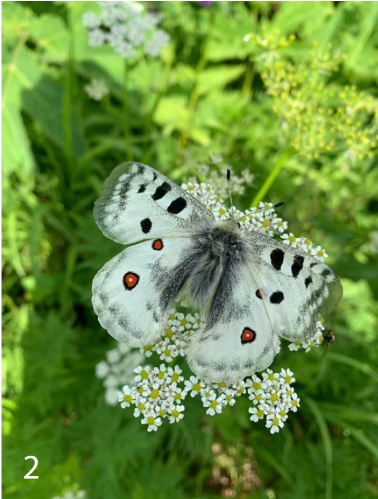
Figure 2. Butterflies of South Ossetia in Nature: 2. Parnassius apollo suaneticus Arnold, 1909, male, Dzaus Distr., Rachinsky Range, near Dодtota, 42°27'25" N / 43°43'18" E, 1750 m