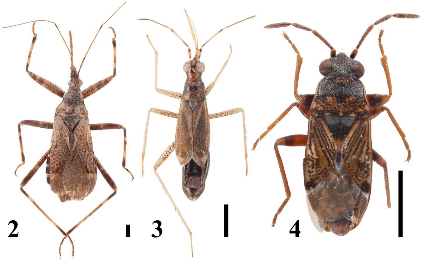
Figure 2. Figures 2-4. New and rare species of Heteroptera for the Kemerovo Region. 2 - Himacerus apterus (Fabricius, 1798) (Nabidae); 3 - Dicyphus stachydis J. Sahlberg, 1878 (Miridae); 4 - Ischnocoris punctulatus Fieber, 1861 (Lygaeidae). 2-4 - dorsal view. Vertical line: 1 mm.