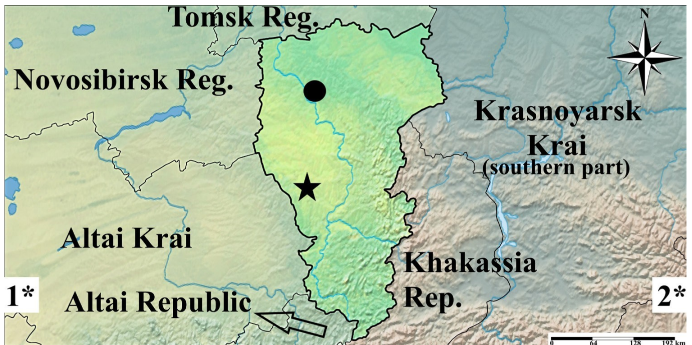
Figure 1. Collection points of true bugs in the Kemerovo Region. Circle – Kedrovsk coal mine; Star – Krasnobrodsk coal mine. 1* – Western Siberia; 2* – Eastern Siberia.

Distribution. Holarctic. Western Siberia: Novosibirsk (Vinokurov and Golub 2007) and Tomsk Regions (Kiritshenko 1910), Altai Krai (Vinokurov and Golub 2007; Rudoï et al. 2023), Altai Republic (Kiritshenko 1910; Vinokurov and Golub 2007); Eastern Siberia: southern part of the Krasnoyarsk Krai (Sahlberg 1878; Reuter 1891; Lindberg 1921; Babichev and Kuzhuget 2019), Republic of Khakassia (Reuter 1891).