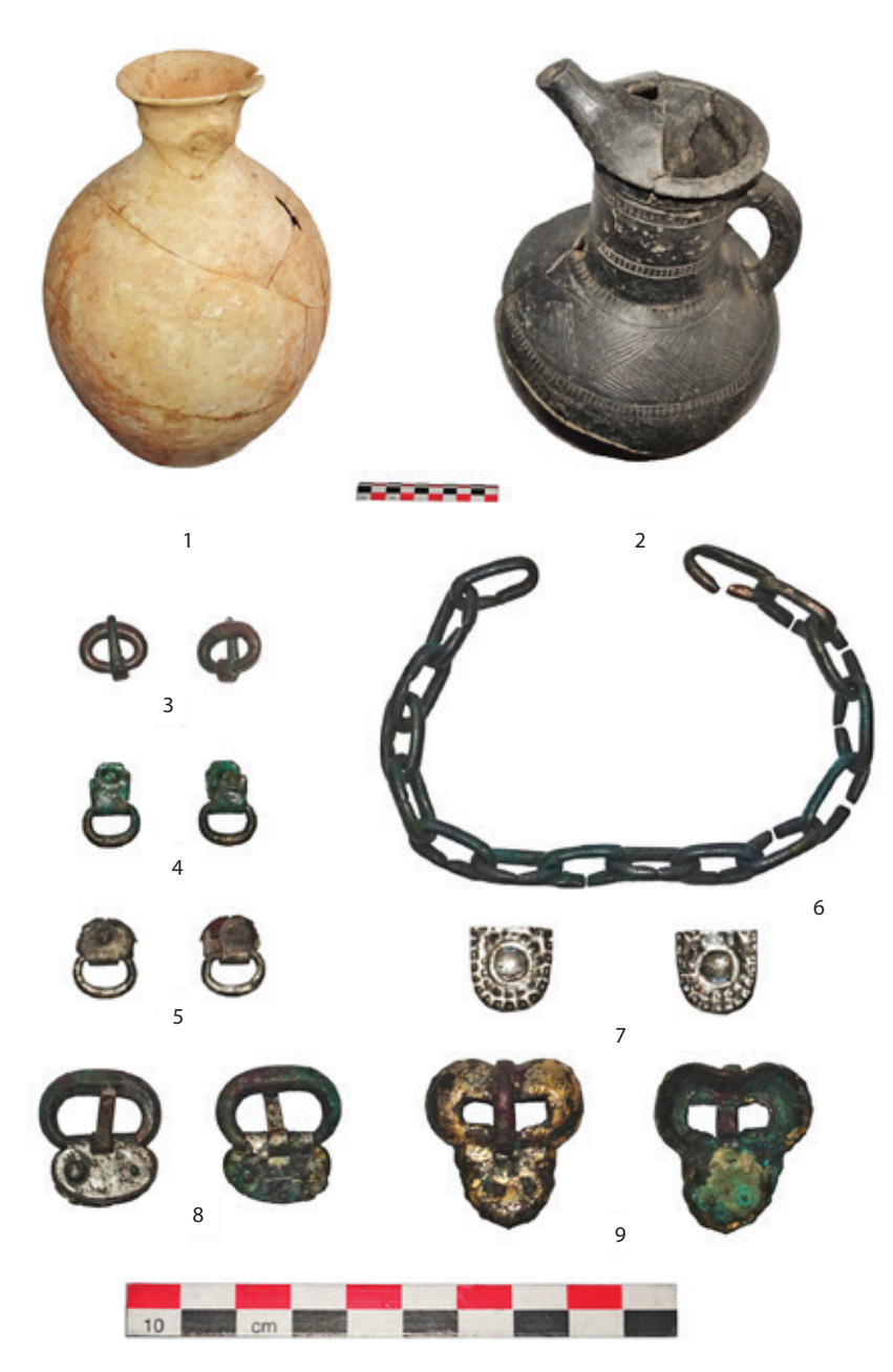
Fig. 5. Findings from the Beslan catacomb burials: 1, 4, 5, 8 – kur. 875; 2, 7, 9 – kur. 876, grave 1; 3 – kur. 874; 6 – kur. 876, grave 2. 1, 2 – pottery; 3, 4, 6 – bronze; 5, 7, 8 – silver; 9 – bronze, gilding

Рис. 5. Находки из захоронений Бесланского курганного катакомбного могильника: 1, 4, 5, 8 — кур. 875; 2, 7, 9 — кур. 876, п. 1; 3 — кур. 874; 6 — кур. 876, п. 2. 1, 2 — керамика; 3, 4, 6 — бронза; 5, 7, 8 — серебро; 9 — бронза, позолота