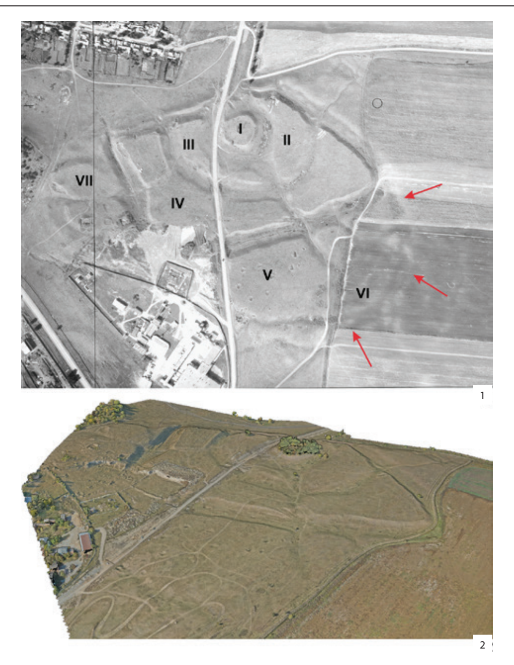
Fig. 1. 1 — view of Zilgi hillfort on the aerial photo of 1980-ties. Plowed outer ditch of the settlement is shown with red arrows; 2 — photogrammetric 3D-model of the hillfort of Zilgi based on the low-altitude aerial survey of 2020. View from the south Рис. 1. 1 — вид Зильгинского городища на аэрофотоснимке 1980-х гг. Красными стрелками показан распаханный внешний ров городища; 2 — трехмерная модель Зильгинского городища, построенная методом фотограмметрии по результатам низковысотной аэрофотосъемки 2020 г. Вид с юга