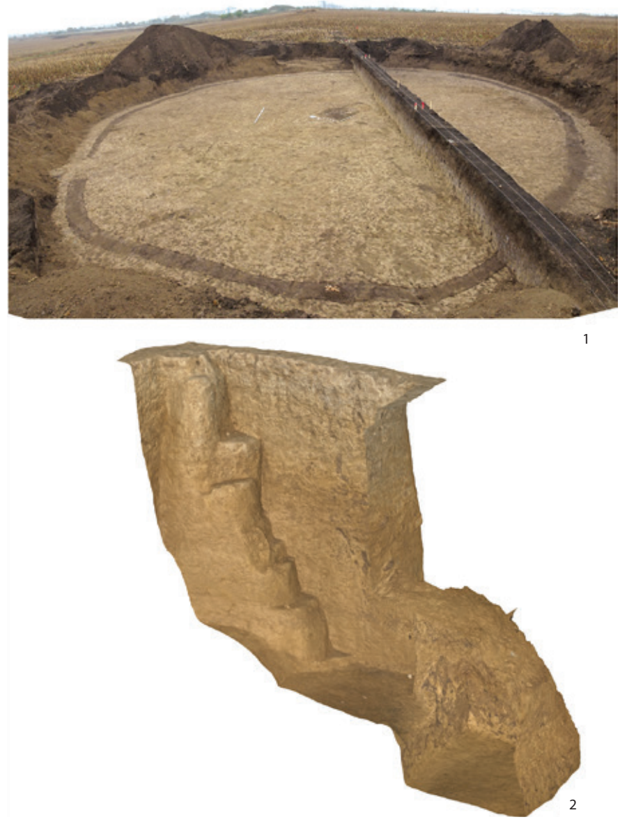
Fig. 4. 1 — Kur. 874, view from the north to the circular ditch and entrance pit of the catacomb; 2 — axonometric view of catacombs 874, based on the results of three-dimensional photogrammetric modeling

bronze buckles and rings with clips, found here, are characteristic of the third quarter of the 4<sup>th</sup> century AD.