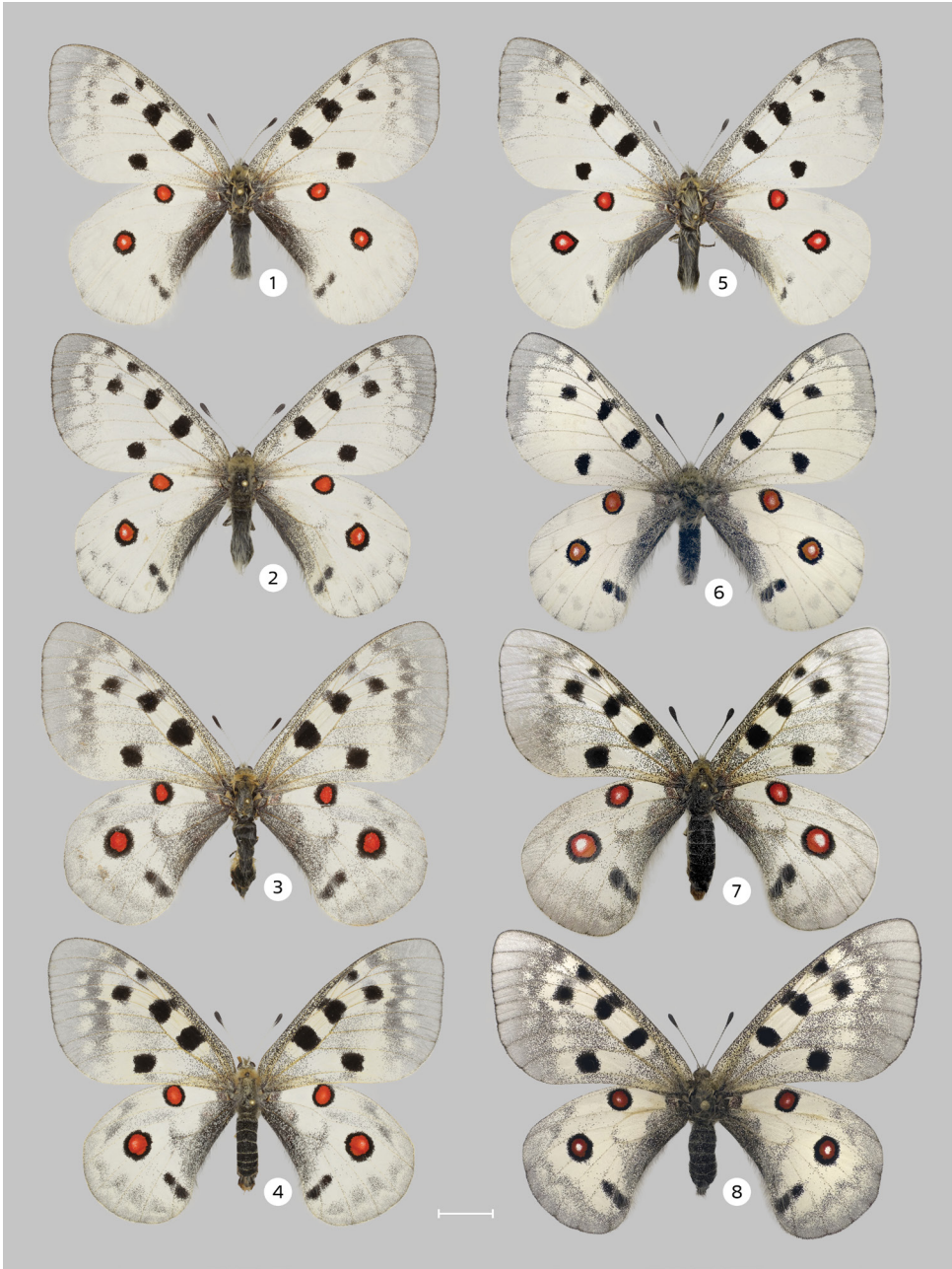
Figure 1. P. apollo , adult specimens:

1 – Parnassius apollo yenisei ssp. nova , holotype, male, Russia, Irkutsk reg., 475 km NW Irkutsk, Nizhneudinsk distr., Uda R., Bolshoi Uk loc., 11-16.06.2011.