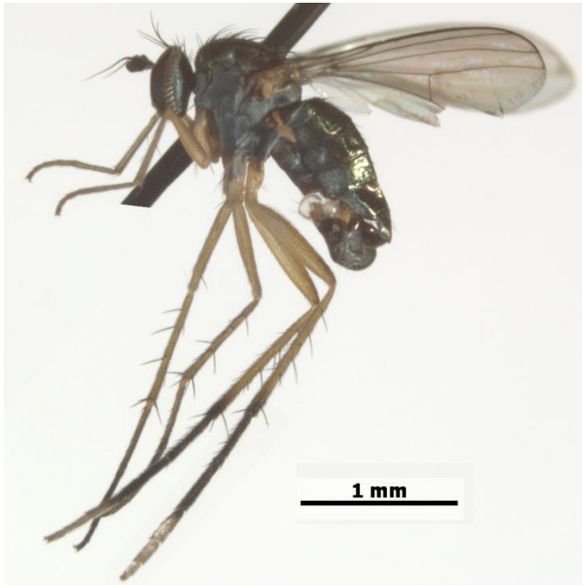
Fig. 2. Afrohercostomus eronis (Curran, 1926), male habitus.