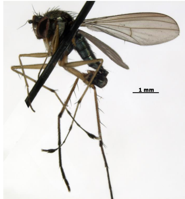
Fig. 3. Afrohercostomus jani (Dyde, 1957), male habitus.