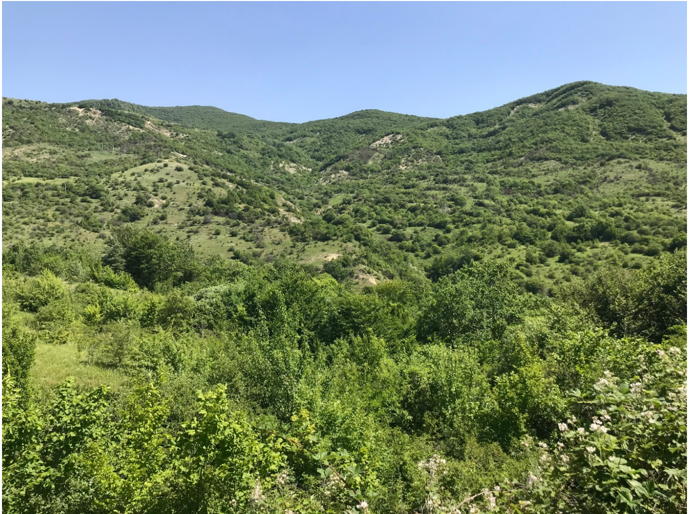
Figure 5. Tskhinval Distr., 2 km NW Grom, 42°10'6"N / 44°11'53"E