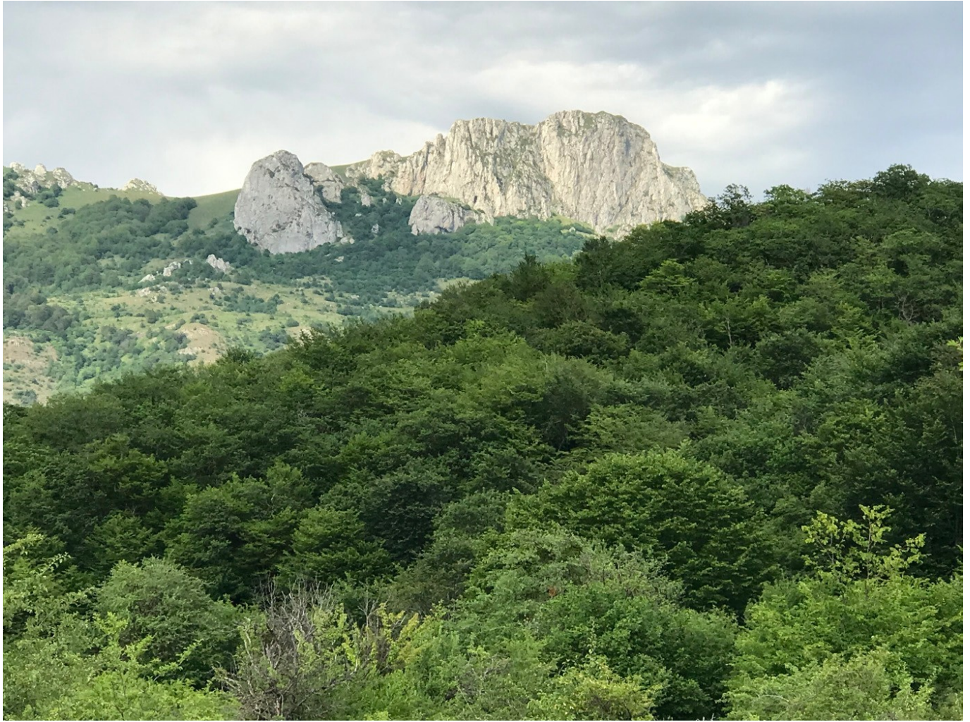
Figure 6. Leningor Distr., 4 km E Leningor, 42°08'45"N, 44°30'55"E