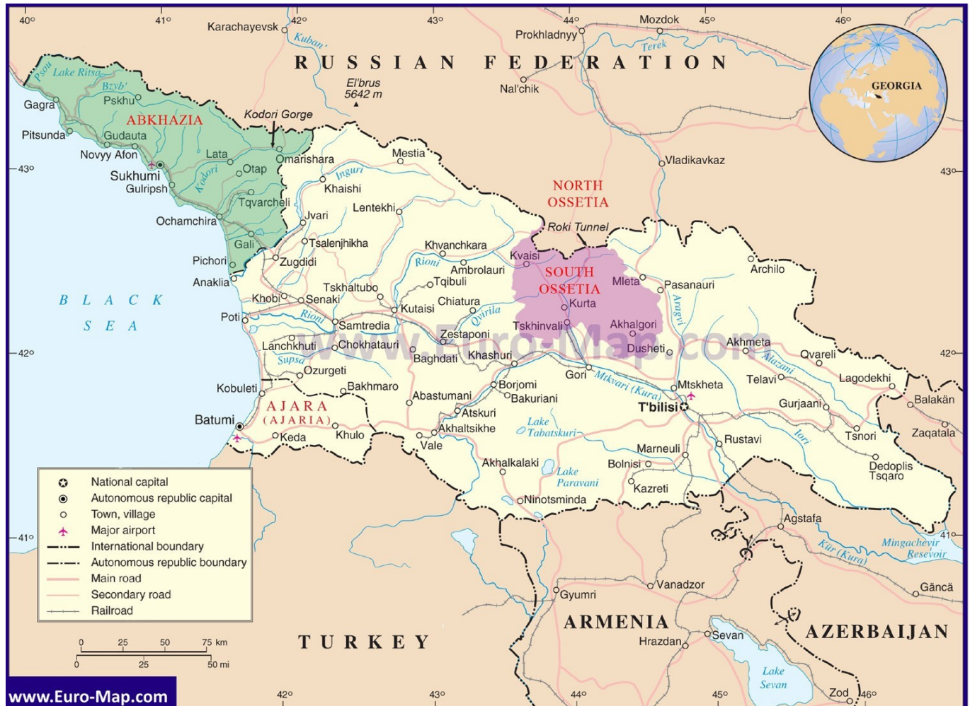
Figure 1. South Ossetia on the map of Caucasus

Ossetia is mountain Khalatsa (3938 m). The mountainous portion of the republic is presented by the Dvaletskiy ridge on the border with Russia and the transverse ridges - Rachinsky, Likhsky, Kesheltsky, Mashkharsky, Dzausky, Gudissky, Kharulsky, Lomissky and Mtiuleti. The foothill area is located in the extreme south of the region, where the valleys of the rivers Prone, Greater and Lesser Liakhva, Mejuda and Ksan go to the northern outskirts of the Inner Kartli Plain.