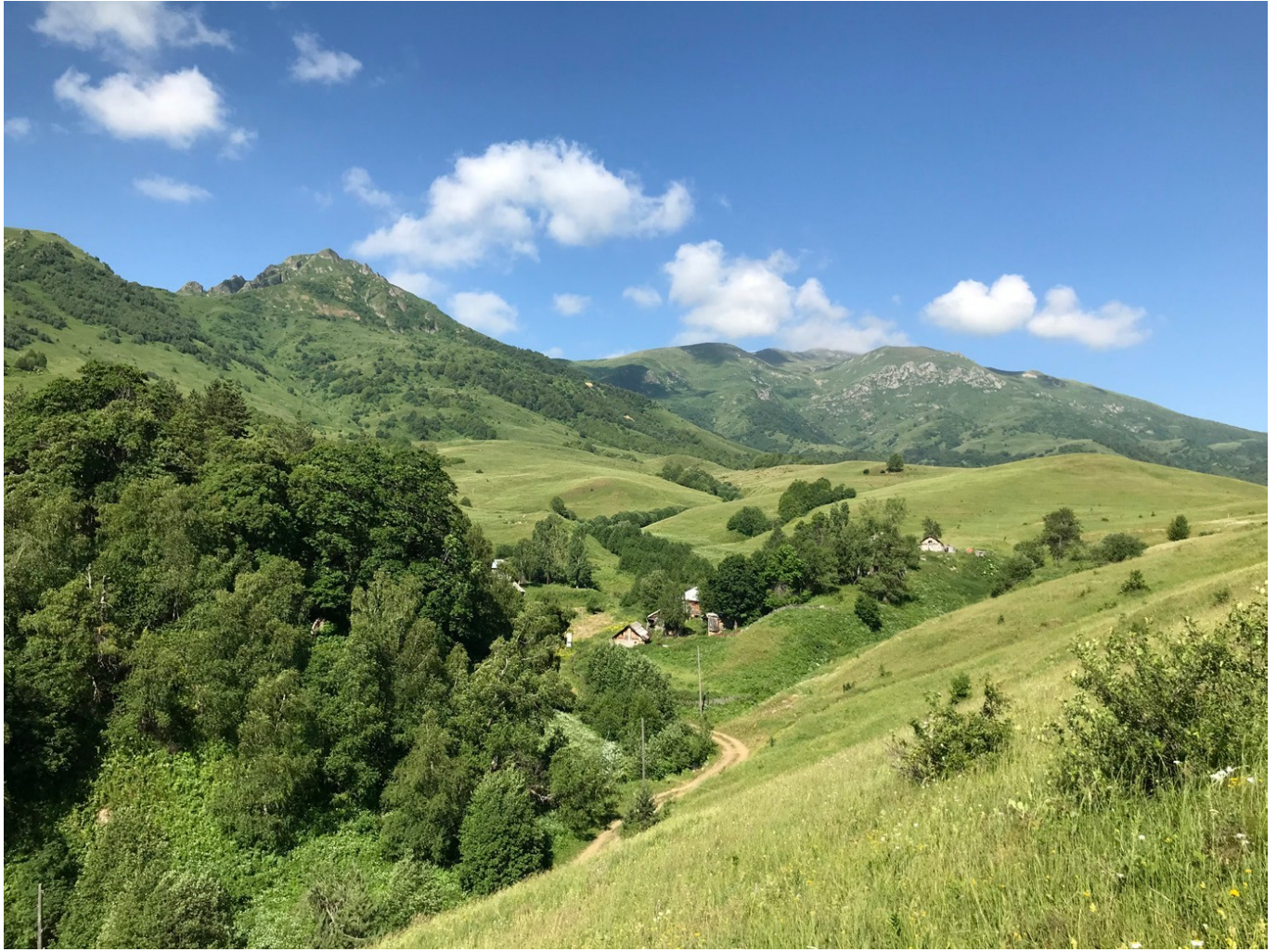
Figure 8. Dzaus Distr., Rachinsky Range, near Dodtota, 42°27'25"N / 43°43'18"E