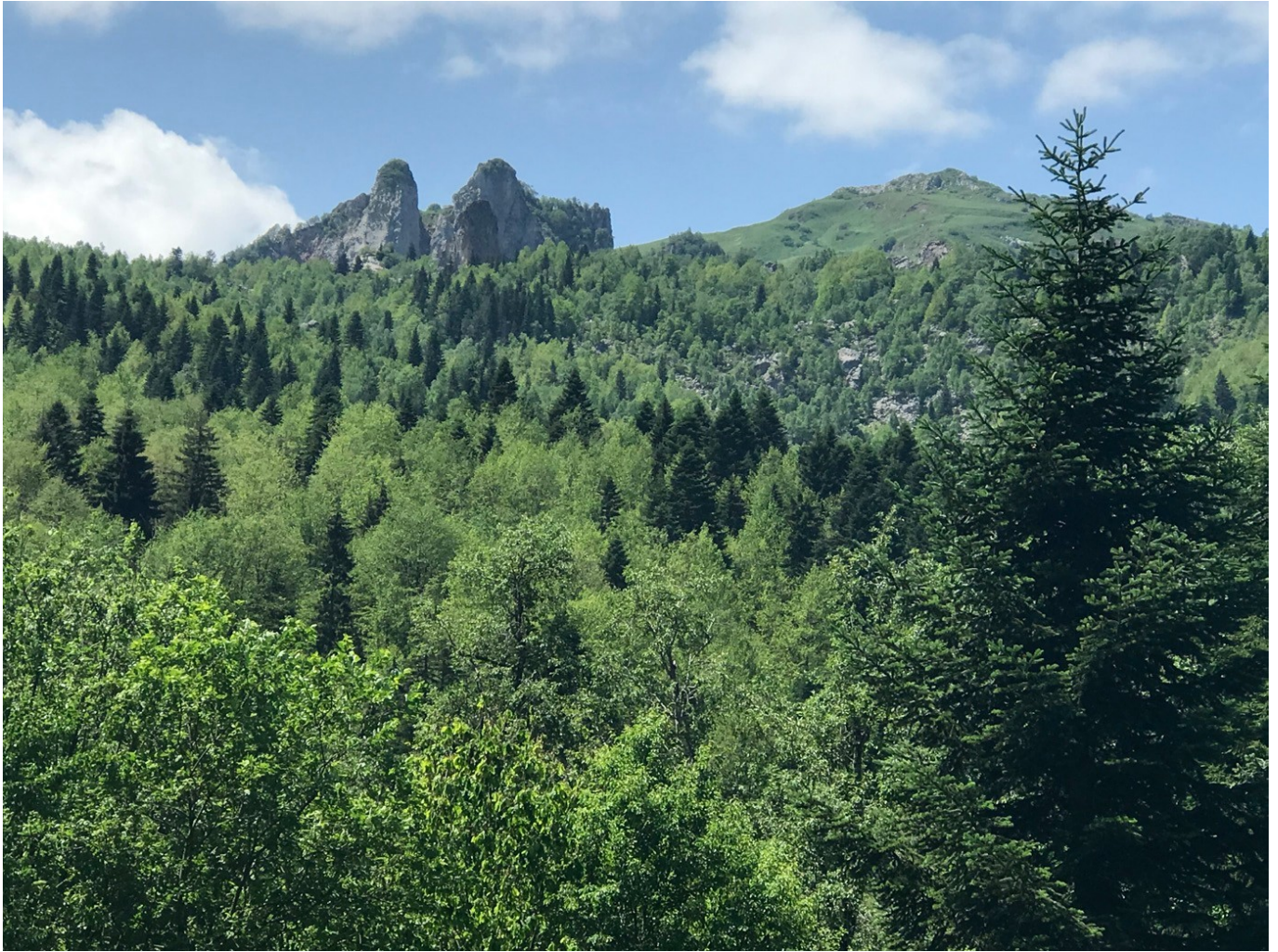
Figure 7. Dzaus Distr. , 4 km NNE Kvaisa , Koz lake , 42°33'32"N / 43°37'59"E