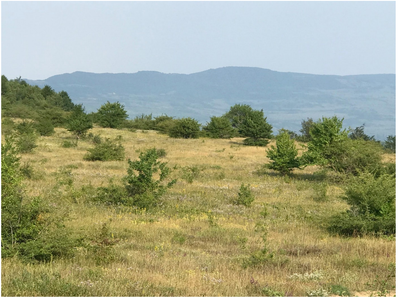
Figure 11. Znaur Distr., 2 km W Dzagina, 42°14'34"N / 43°43'11"E