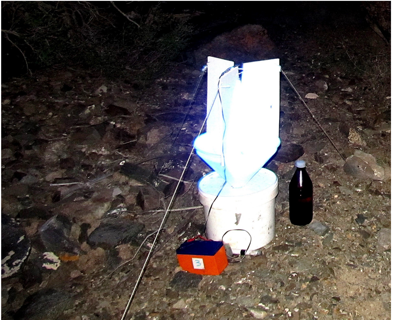
Figure 3. Autonomous light traps