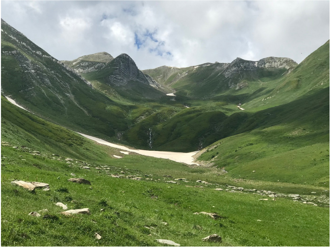
Figure 10. Dzaus Distr., Mtiulet Range, near Erman, 42°31'2"N / 44°14'10"E