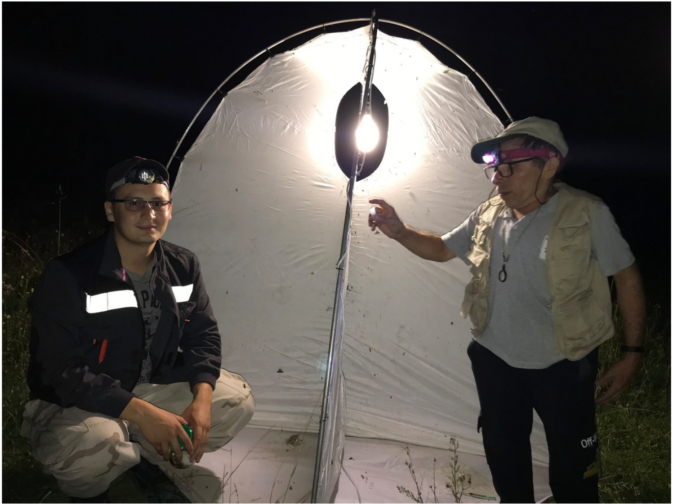
Figure 2. Light screens Naturaliste-180