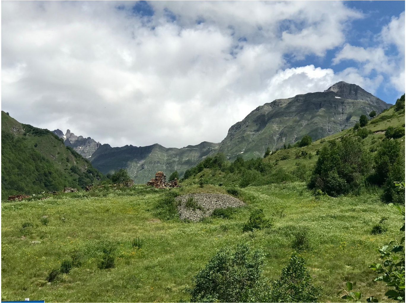
Figure 9. Dzaus Distr., Dvalet Range, near Kherusel't, 42°32'37"N / 43°47'32"E