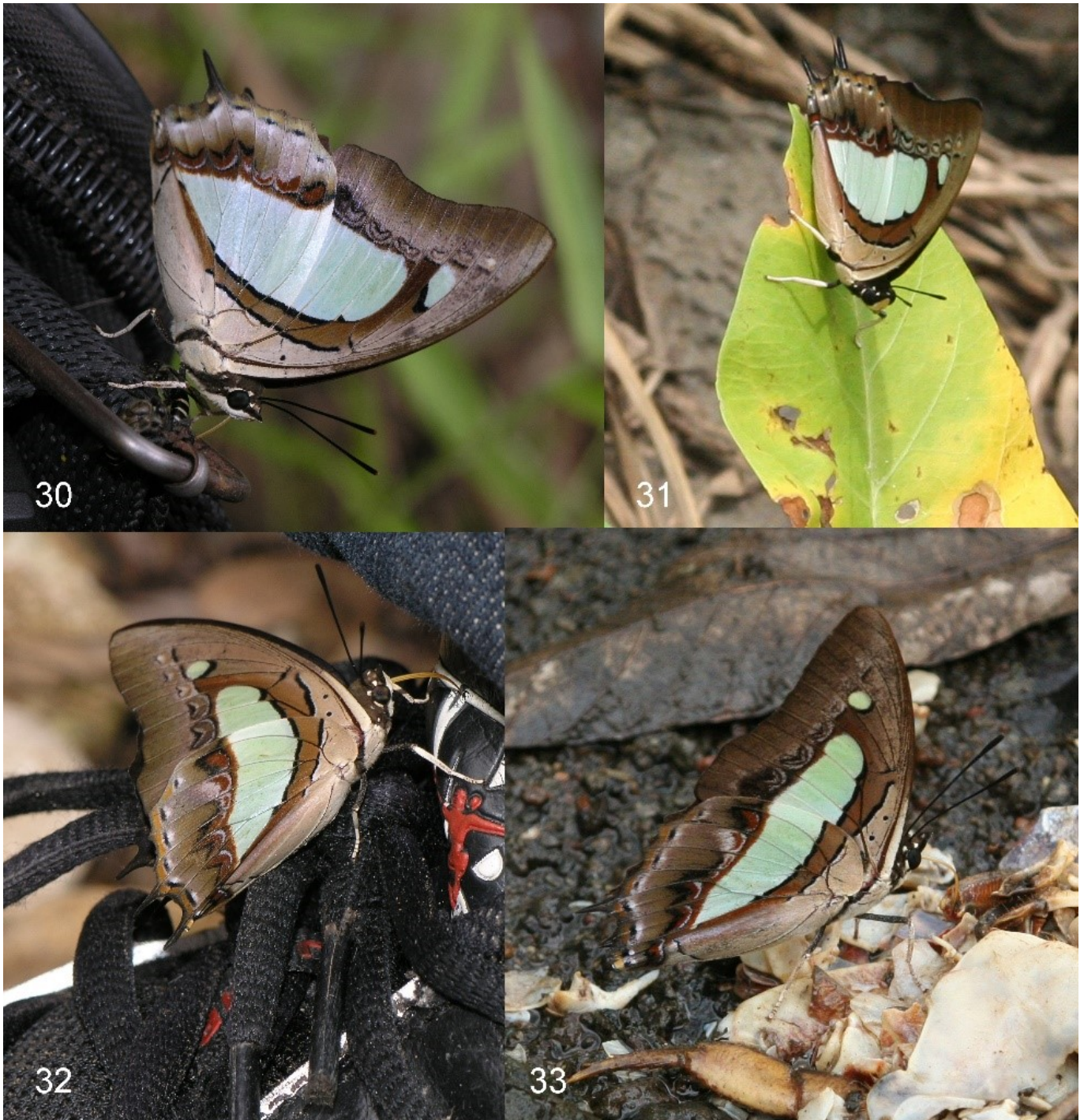
Figure 6. Figs. 30-33 Both Polyura arja arja (30-31) and Polyura athamas athamas (32-33) photographed in two localities of eastern Cambodia: : 74\Yak Kae Rivulet, 4.06.2013 (30, 32) and 93\Far river', 27.06.2018 (31, 33). Not to scale.