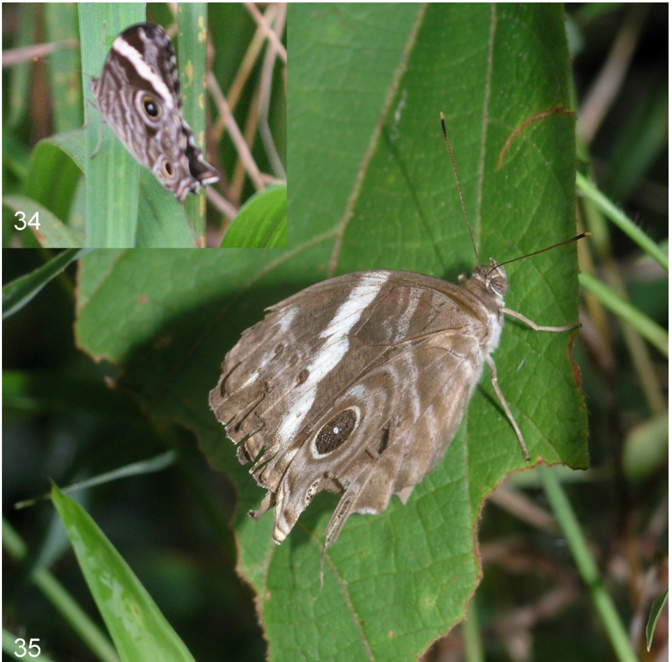
Figure 7. Figs. 34-35 Females of Lethe rohria rohria , new for Cambodia, in Mondulhiri Province: 34 - 85\2.5 km SE of Sen Monorom, 23.06.2018; 35 - 88\Dak Dam, 16.06.2014. Not to scale.

Lethe minerva tritogenites Fruhstorfer, 1911 § - Ra: ♂, 67\Lake Yak Lom, 31.05.2013.