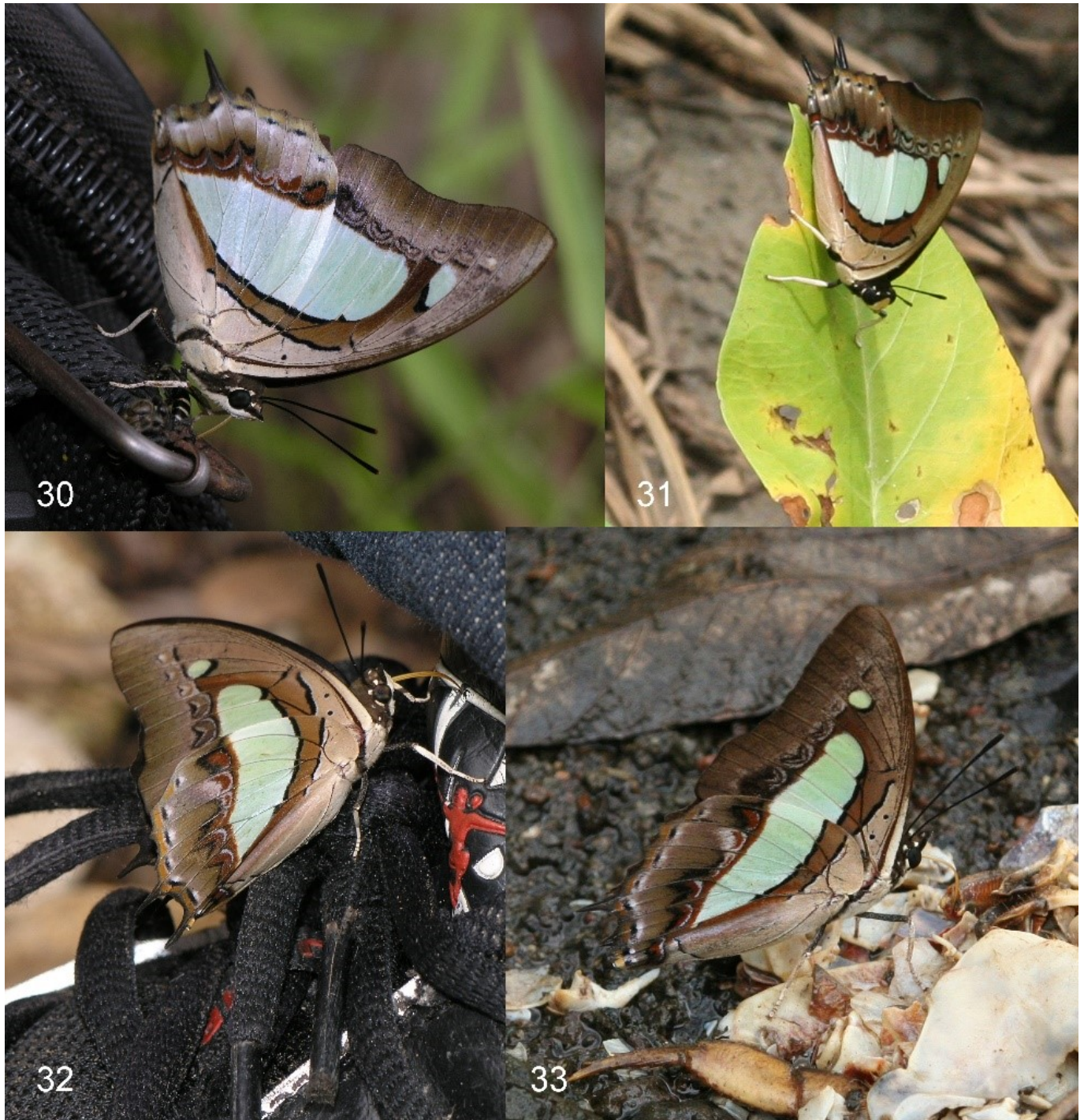
Figure 6. Figs. 30-33 Both Polyura arja arja (30-31) and Polyura athamas athamas (32-33) photographed in two localities of eastern Cambodia: : 74\Yak Kae Rivulet, 4.06.2013 (30, 32) and 93\Far river', 27.06.2018 (31, 33). Not to scale.