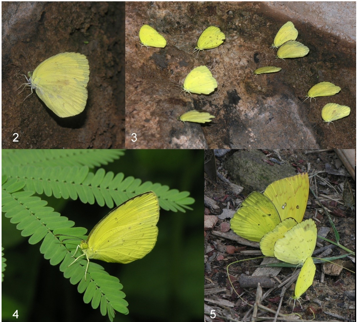
Figure 2. Figs. 2-5 Problematic Eurema spp. from eastern Cambodia: 2 - E. hecabe hecabe , a male with reduced UNS dark markings, 76\‘Lowest river’, 17.06.2014; 3 - similar males in a company with those with normally developed UNS marking in the same place; 4 - Eurema sp. with only apical comma-like spot in cell, 73\Yorn village, 5.06.2013; 5 - a similar male (below) in a company of two males of E. hecabe hecabe (in the centre) , and also a male of Ixias pyrene verna and a female of Catopsilia pomona pomona f. pomonain in the same place. Not to scale.

Eurema sp. - Ra: ♂♂, 73\Yorn village, 5.06.2013. UNF has a well expressed comma-like cell-end spot, as in E. hecabe , E. sari (Horsfield, 1829), E. andersoni (Moore, 1886) but, unlike these species, no any spot inside the cell. Also UNF without apical dark wash (unlike E. sari ), the UPF black border is seen through as having a deep incision (as in E. hecabe and E. andersoni ), but the HW outer margin is rounded rather than subungulate (unlike E. hecabe ) (Fig. 4). In the photograph of Fig. 5 this species is in a company of E. hecabe with normally developed markings.