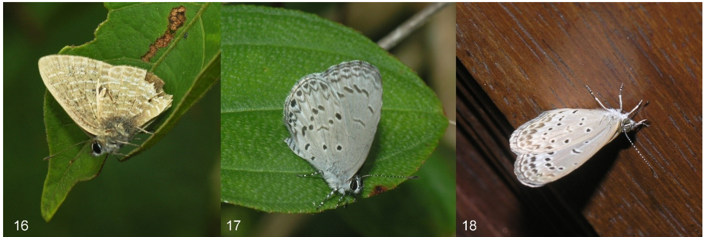
Figure 4. Figs. 16-18 Polyommatae from eastern Cambodia (a provisionally identified, an unidentified and a new for Cambodia): 16 - Nacaduba cf beroe gythion , 82\Sen Monorom W suburbs, 11.06.2014; 17 - Udara/Celastrina sp., 88\Dak Dam (a tall Cyperus swamplet), 16.06.2014; 18 - Zizeera maha maha , 87\Long Vibol Guesthouse, 7.06.2014. Not to scale.

* Zizeera maha maha (Kollar, 1848) § - Mo: 87\Long Vibol Guesthouse, 7.06.2014 (Fig. 18).