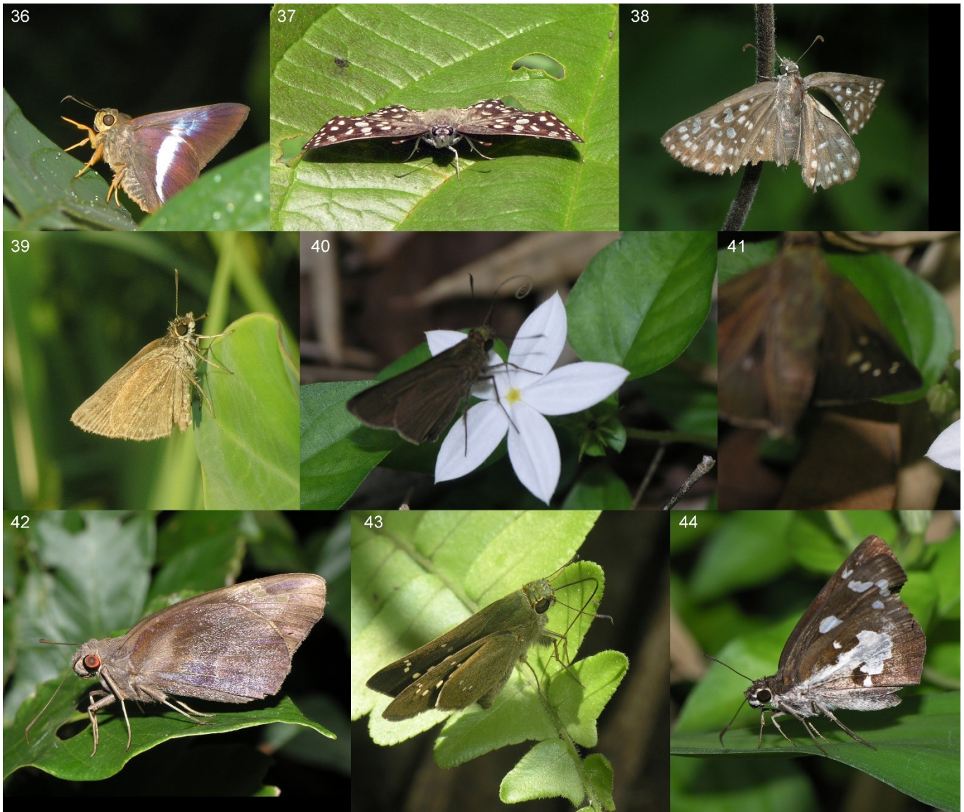
Figure 8. Figs. 36-44 Hesperidae, new for Cambodia or provisionally identified: 36 - Bibasis sena sena , 73\Yorn village, 4.06.2013; 37 - Caprona agama agama , 69\Cha Ong Waterfall, 31.05.2013; 38 - Caprona alida alida , 84\Sen Monorom brook, 8.06.2014; 39 - Aeromachus cf. pygmaeus , 86\Sen Monorom ponds, 8.06.2014; 40-41 - ? Caltoris sp., Ra : 67\Lake Yak Lom, 30.05.2013; 42 - Gangara thyrasis thyrasis , 73\Yorn village, 4.06.2013; 43 - Pelopidas cf. mathias mathias , 95\Buu Sraa Waterfall (in spray area just below the upper tile), 4.08.2016; 44 - Udaspes folus , 67\Lake Yak Lom, 30.05.2013. Not to scale.

Ancistroides nigrita maura (Snellen [1880]) § - Mo : 95\Buu Sraa Waterfall (at headquarters), 3.08.2016.