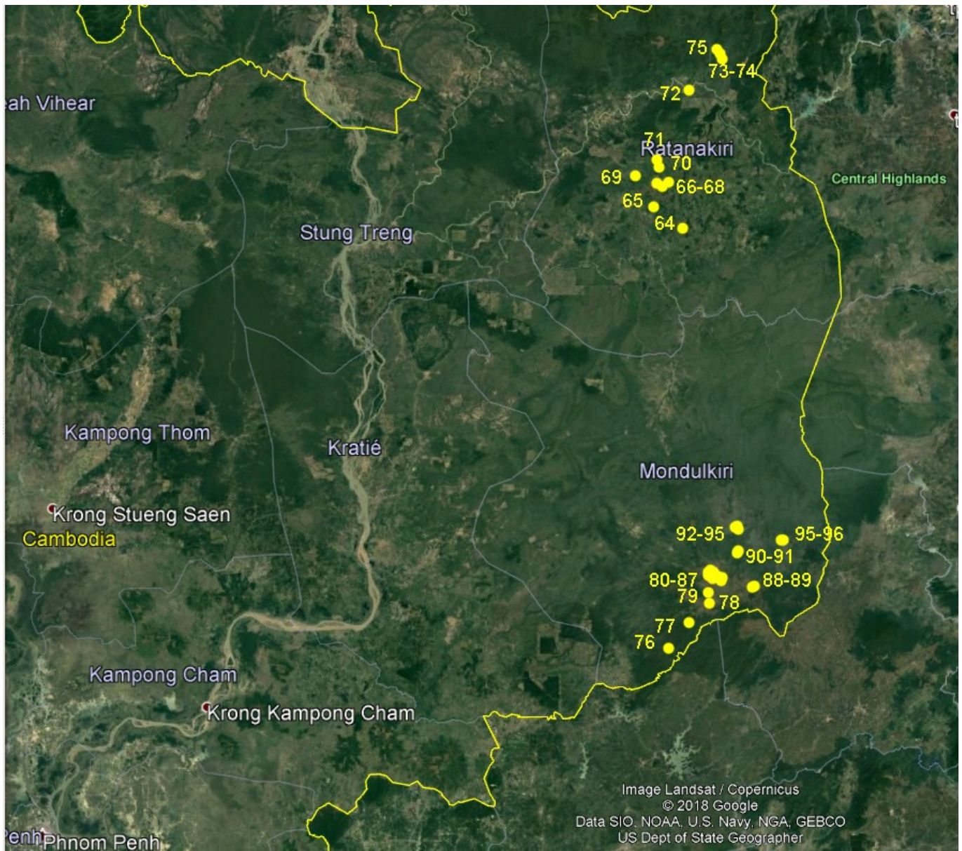
Figure 1. Fig. 1 Disposition of localities where butterfly photos were taken in eastern Cambodia. For explanation of numerals see the text.

69\Cha Ong Waterfall: the rivulet upstream Cha Ong Waterfall flowing partly openly above flat rocks, 7 km WNW of Ban Lung. 13.7592' N, 106.9300-9319 E, 219-221 m.