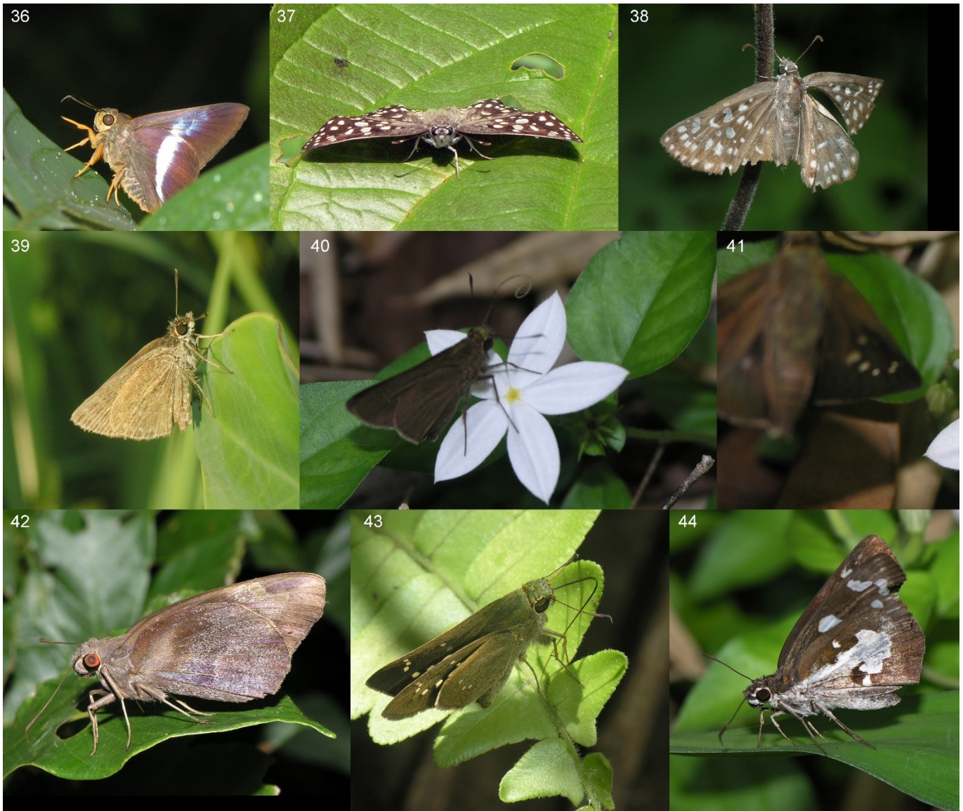
Figure 8. Figs. 36-44 Hesperidae, new for Cambodia or provisionally identified: 36 - Bibasis sena sena , 73\Yorn village, 4.06.2013; 37 - Caprona agama agama , 69\Cha Ong Waterfall, 31.05.2013; 38 - Caprona alida alida , 84\Sen Monorom brook, 8.06.2014; 39 - Aeromachus cf. pygmaeus , 86\Sen Monorom ponds, 8.06.2014; 40-41 - ? Caltoris sp., Ra : 67\Lake Yak Lom, 30.05.2013; 42 - Gangara thyraxis thyraxis , 73\Yorn village, 4.06.2013; 43 - Pelopidas cf. mathias mathias , 95\Buu Sraa Waterfall (in spray area just below the upper tile), 4.08.2016; 44 - Udaspes folus , 67\Lake Yak Lom, 30.05.2013. Not to scale.

Ancistroides nigrita maura (Snellen [1880]) § - Mo : 95\Buu Sraa Waterfall (at headquarters), 3.08.2016.