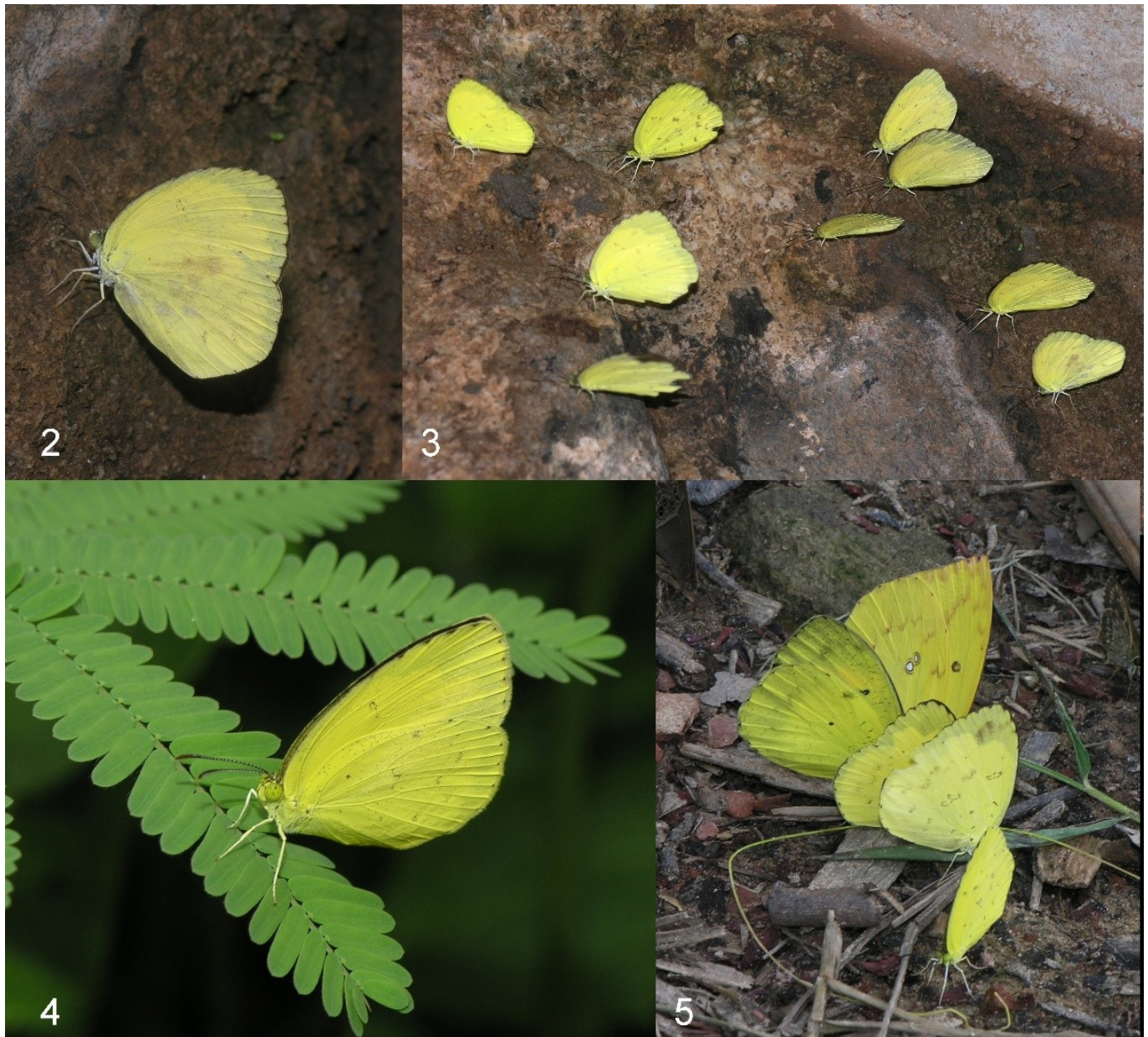
Figure 2. Figs. 2-5 Problematic Eurema spp. from eastern Cambodia: 2 - E. hecabe hecabe , a male with reduced UNS dark markings, 76\‘Lowest river’, 17.06.2014; 3 - similar males in a company with those with normally developed UNS marking in the same place; 4 - Eurema sp. with only apical comma-like spot in cell, 73\Yorn village, 5.06.2013; 5 - a similar male (below) in a company of two males of E. hecabe hecabe (in the centre), and also a male of Ixias pyrene verna and a female of Catopsilia pomona pomona f. pomonain in the same place. Not to scale.